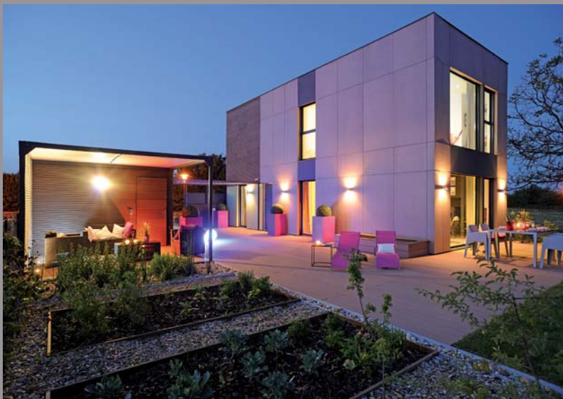
Modulife show home (France) - CLIPSO walls and ceilings Installation: Groupe MCP, technologie MODULIFE