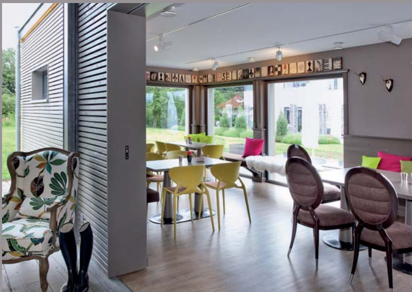
Show tearoom (Germany) - CLIPSO ceilings Installation: SchwörerHaus KG, Jürgen Lippert