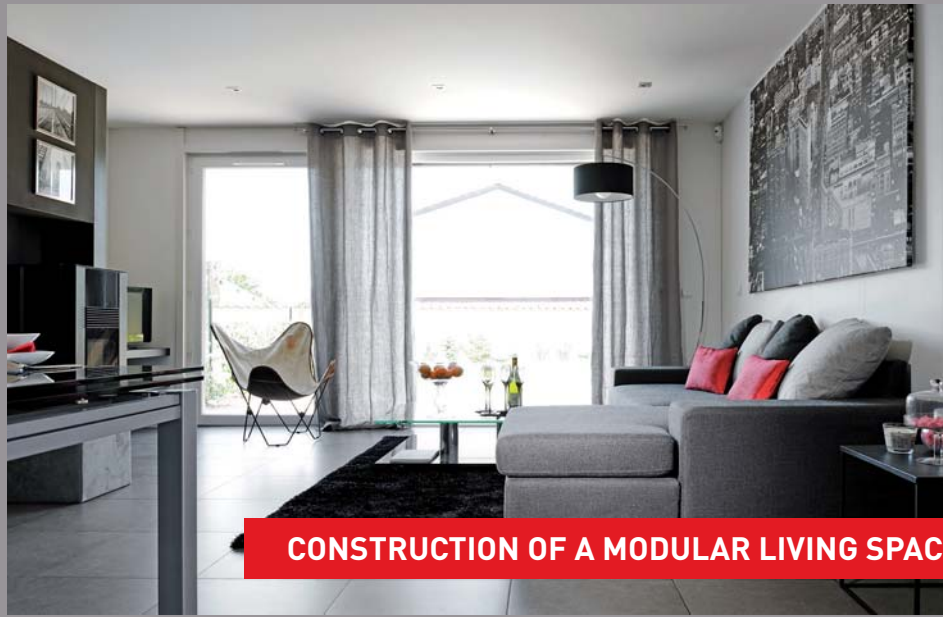
Modulife show home (France) - CLIPSO walls and ceilings Installation: Groupe MCP, technologie MODULIFE