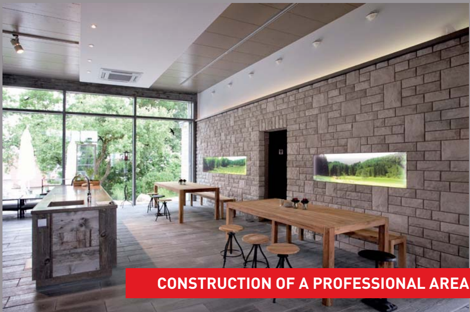
Show tearoom (Germany) - CLIPSO ceilings Installation: SchwörerHaus KG, Jürgen Lippert