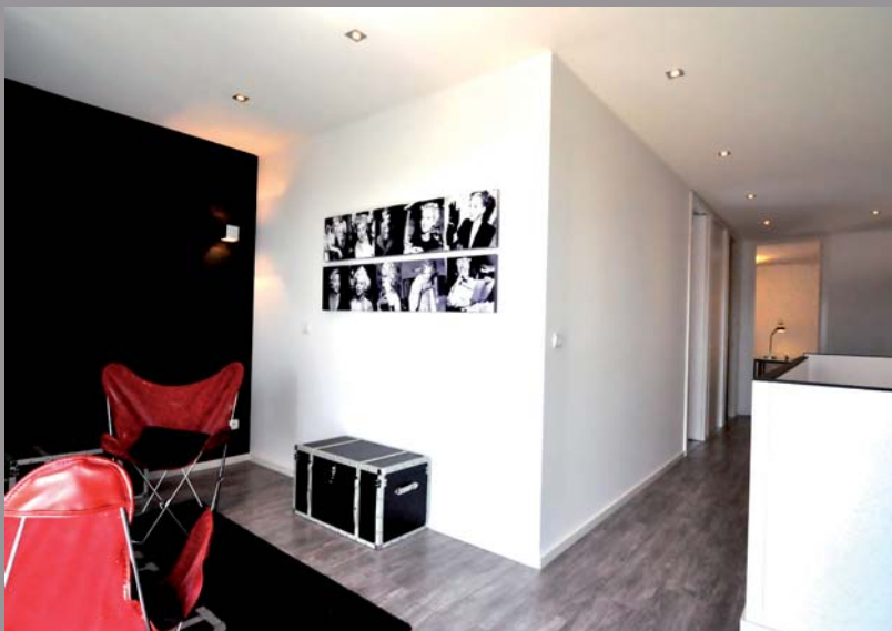
Modulife show home (France) - CLIPSO walls and ceilings Installation: Groupe MCP, technologie MODULIFE