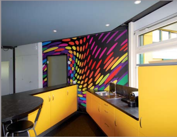
Bar kitchen - Switzerland (standard ceiling and printed wall) Installation: CLIPSO