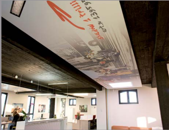
Belgatrade-Wattson-Deinze - Belgium (printed ceiling) Installation: MonaVisa

CLIPSO USA Inc. 3742 W. Century Blvd Unit # 7 Inglewood, CA 90303 USA