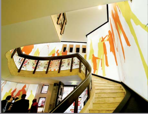
Twynstra Gudde - Netherlands (backlit printed wall) Architect: Kubik - Installation: I-OMS NL