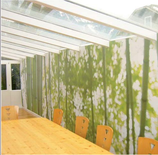
Dining room - Switzerland (printed wall) Installation: Fontannaz W et PH Décoration

PVC-free clipso coverings are environmentally friendly.