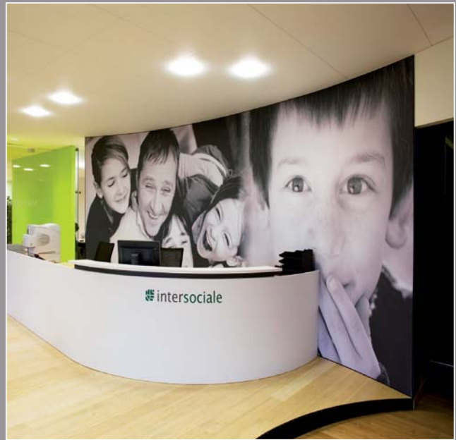
Intersociale-Brussels - Belgium (printed and acoustic project) Architect: Avanti Design - Installation: MonaVisa

Moreover, clipso coverings are moisture-resistant and heat-resistant and are classed as B-s1,d0 (ex M1).