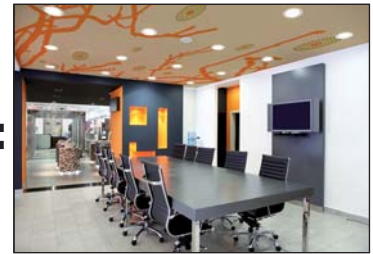
Your final ceiling