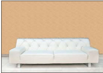
Your initial wall