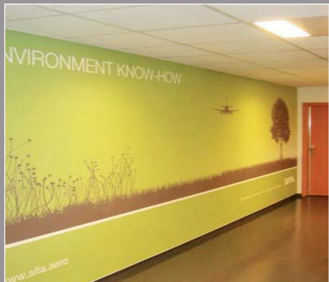
SITA - Switzerland (printed wall) - Installation: Reflecta

Lastly, the greatest added-value was being able to project the company's image via its environment. In the past, it was a costly and restrictive investment, but now we have found the right solution with clipso.