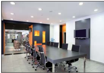
Your initial ceiling