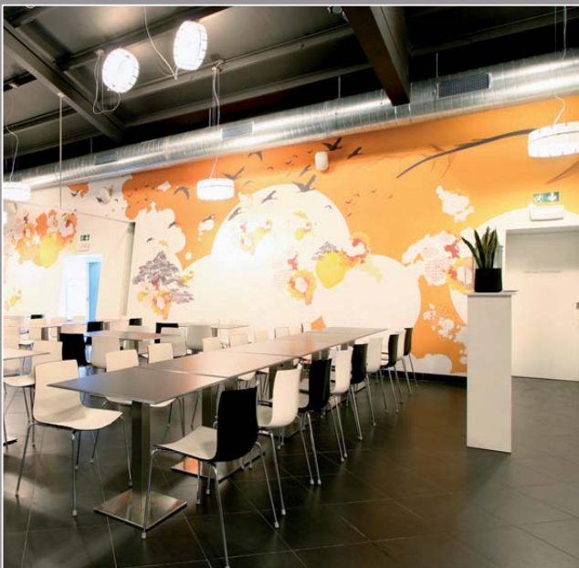
DarDar-Roeselare - Belgium (printed and acoustic project) Architect: Dtonic - Installation: MonaVisa

clipso design® can adapt the format of all images and produce high-definition prints (higher than 300 DPI) ensuring outstanding rendering.