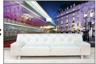
Your final wall