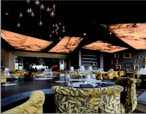
The Last Supper - Luxembourg (printed frames) Architect: Miguel Cancio Martins - Installation: Bert Déco