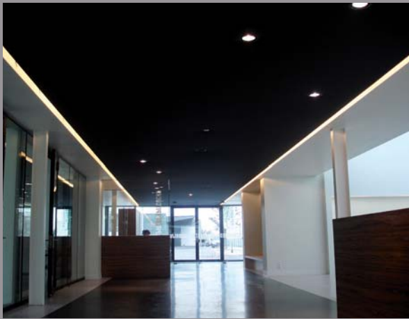
Bedrijvencentrum (Belgium) Installation: MonaVisa - Architect: Buro Architec