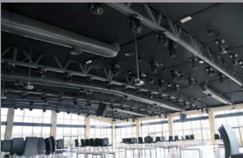
Reception room (Israel) - Installation: Glarus Ltd