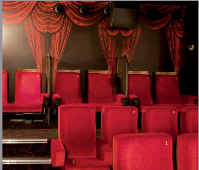
Cinema (Switzerland) - Installation: Lezzi

The visual and technical results were completely successful, and the acoustic performance is excellent, much to the high overall satisfaction of the management and the audience.