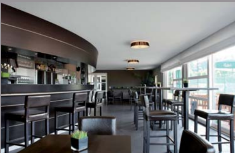
Tennisclub TC Isis (Belgium) Architecte: Redline Projects - Installation: MonaVisa

clipso coverings treat acoustic absorption.