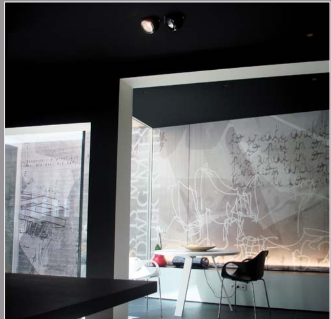
Architextuur offices (Belgium) - Installation: MonaVisa Architect: Architextuur-Thomas Coucke

Thanks to the specially developed coverings for ceilings and walls, clipso contributes to the enhancement of good acoustics in any environment and thus provides a source of comfort and wellbeing to which we all aspire, in our daily lives.