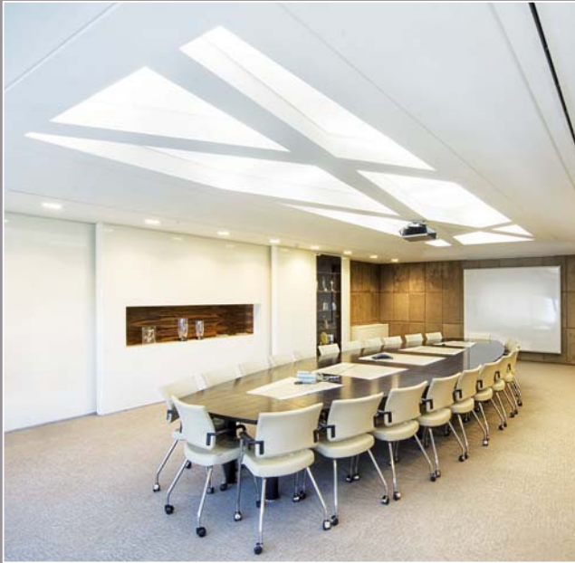
Unilever (Turkey) - Installation: TTI Elektrik Elektronik

Thanks to clipso coverings and to the numerous installation possibilities, you can optimise the acoustic performances of your walls and ceilings as well as your frames, screens, lightboxes, suspended ceilings, sliding partitions, etc.