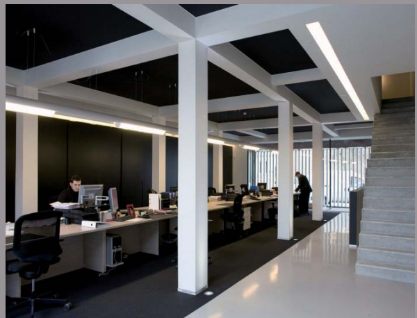
Immo Danneels Real Estate (Belgium) Installation: MonaVisa - Architect: Lineos-Chris Vantornout

CLIPSO USA Inc. 3742 W. Century Blvd Unit # 7 Inglewood, CA 90303 USA