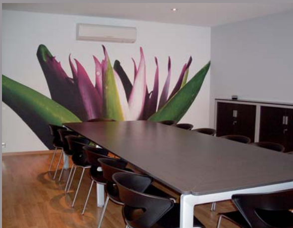
CLIPSO Productions meeting room (France) Installation: CLIPSO