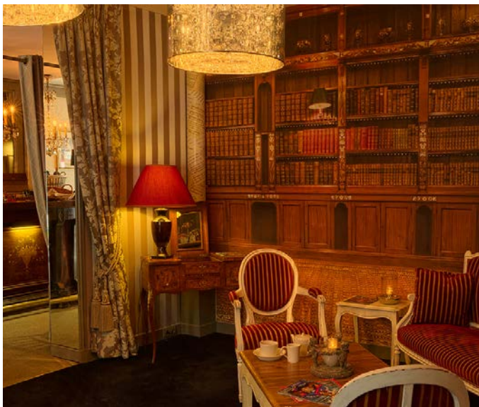
Claridge Hotel, Paris (FRANCE) - Trompe-l'oeil printed wall - Fitter: Sols Décoration Murs

CLIPSO gives you the choice: a plain stretch fabric, a digital printed covering, a LED lighting solution, an acoustic ceiling or wall... or even a frame from our new brand AEROCEILING .