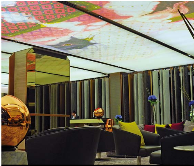
Sukhumvit Hilton Hotel, Bangkok (THAILAND) - Fitter: CCSE Group - Architect: PIA Interior