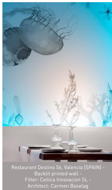
Restaurant Destino 56, Valencia (SPAIN) - Backlit printed wall - Fitter: Ceilica Innovacion SL - Architect: Carmen Baselag

At least, AeroCustom gives you carte blanche to customize your aluminium frame. We take charge of digital print based on your own file, imagery, logo or photo from a photo library. AEROCEILING by CLIPSO is the perfect product to sublimate your interior as well as to communicate efficiently, either for one-shot or for permanent campaigns.