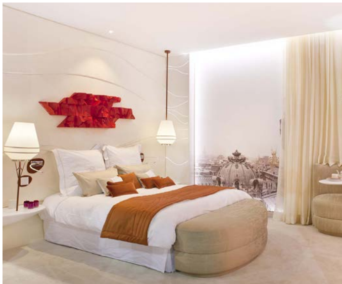
Conceptual room «Senses Room», Paris (FRANCE) - Backlit printed wall and white acoustic ceiling - Fitter: Francis Von Der Wall