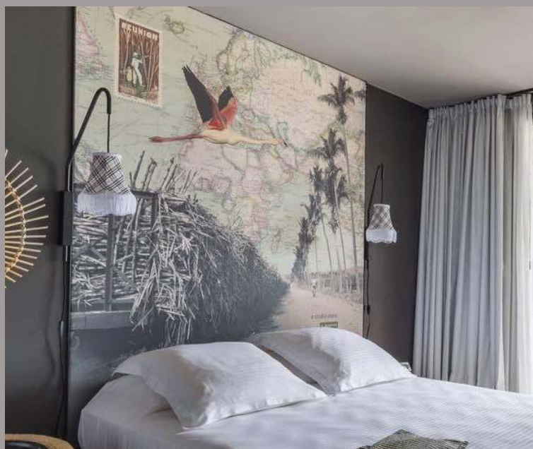
Hotel Dina Morgabine (La Reunion Island, FRANCE) - Headboards - Printed acoustic fabrics - Fitter: Bernard Hauptert

72 rooms, for a total surface of 315 sqm, were fitted with Clipso stretch fabrics over the course of a month and a half. The step 1 consisted of applying a first coat of primer. Following this, the black coloured wall profiles were installed. In order to accelerate this process, Bernard Hauptert chose the stapable version of the products, so he could quickly fix them in place. At the same time, an acoustic matting was stapled to enhance the acoustic insulation of each room. The matting was then covered with an Acoustic Clipso stretch fabric, printed with one out of the 5 images selected by the client. Clipso Design helped out to size each of the images quickly. The project was managed over 45 days, with a minimum impact on the daily business of the hotel: the products are fitted at ambient temperature, meaning there is no odour, no nuisances and the rooms could be rented out straight away again.