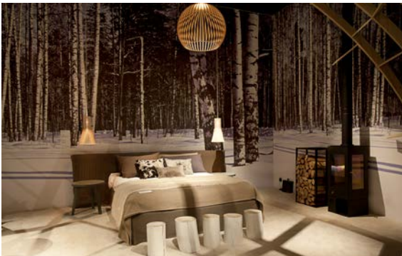
Fashion space Equip'Hotel 2012 (FRANCE) - Printed wall - Fitter: CLIPSO - Photos and design: Elizabeth Leriche