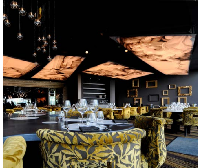
Restaurant The Last Supper (LUXEMBOURG) - Backlit and printed frames - Fitter: Bert' Déco - Architect: Miguel Cancio Martins