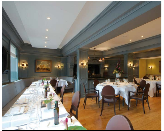
Restaurant La Maison du Cygne (BELGIUM) - Fitter: Aenea Design Interior