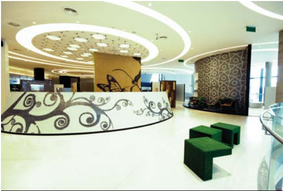
Hall SCG Experience (THAILAND) - Backlit ceiling - Fitter: CCSE Group