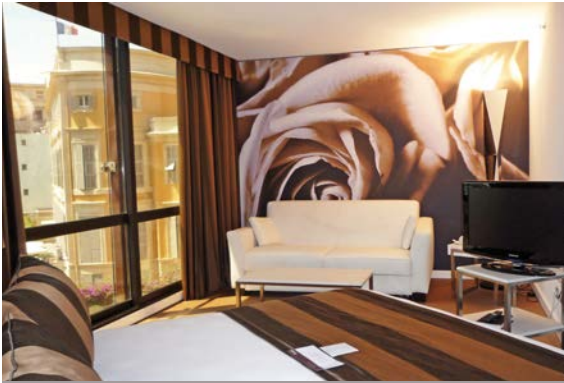
Hotel Eiffel Park, Paris (FRANCE) - Printed ceiling and wall - Fitter: Silva Création