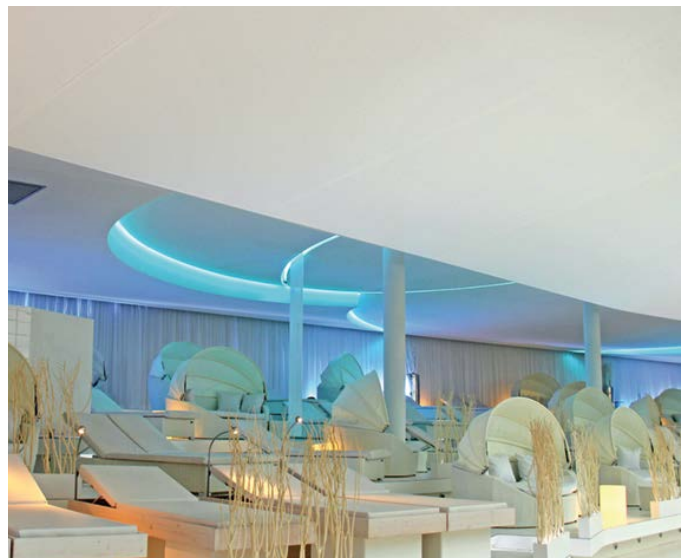
Pool complex Badewelt, Sinsheim (GERMANY) - White acoustic ceiling - Fitter: Art Design Hahn - Architect: Architekturbüro Wund