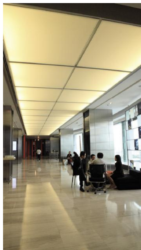
Commercial Space - THAILAND Backlit frames Installation: Chingchai & Sons Engineering Co.,Ltd (CCSE)