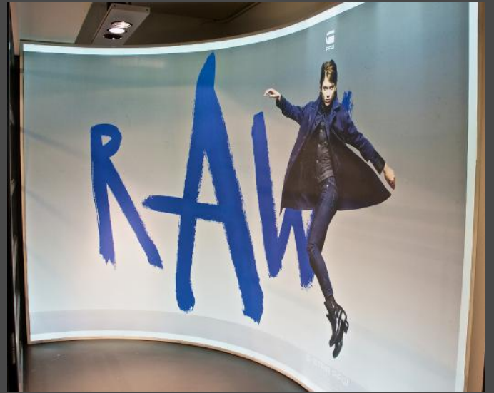
Shop - Germany Fixed curved cabinet, 140 mm thick. Printed covering.

The printed fabric clipped to frames can be changed with the brand's collections, as so can the removable partitions that divide the different spaces. The parent company liked the concept so much that I was asked to deploy it in all its shops worldwide.”