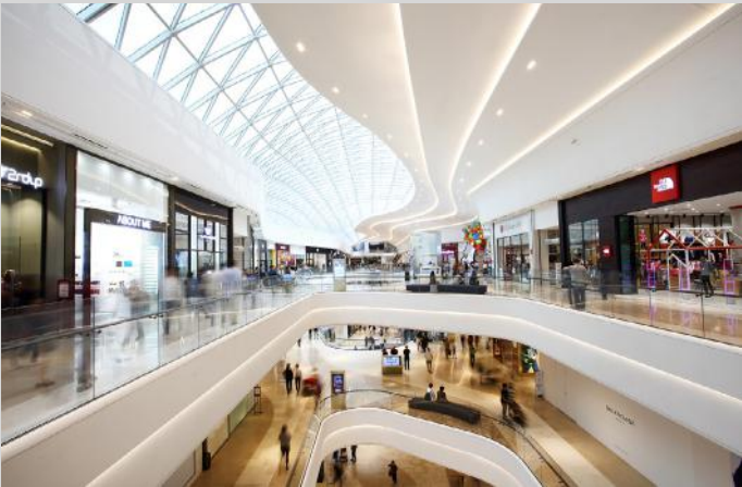
Shopping Centre - South Korea White acoustic ceiling - Installation: EFAS