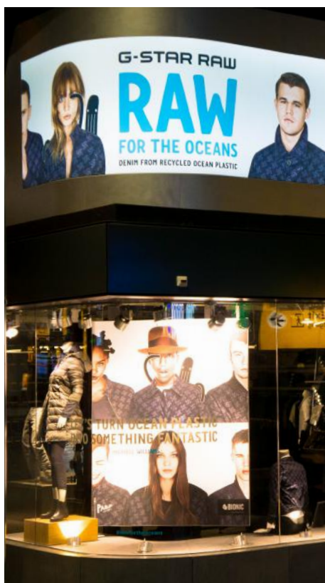
Shop - Germany Fixed curved cabinet. 140 mm thick. Printed covering.