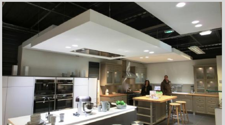
Sales area - FRANCE XXL acoustic frame with light integration and hood Installation: KALLISTE