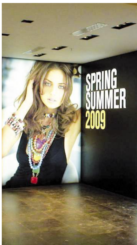
Ready-to-Wear Store - PORTUGAL Printed backlit partition Production: L2 Spirit