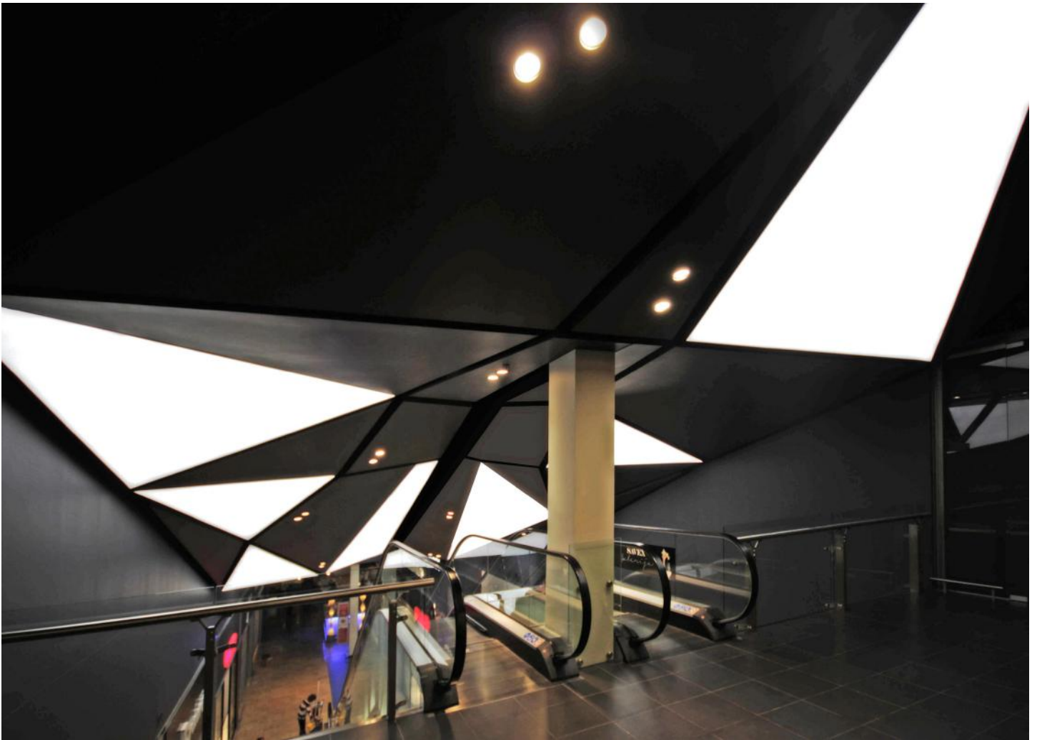
Armageddon, Akropolis Shopping Centre - Vilnius - Lithuania Translucent backlit ceilings - Architect: Performa Architectural Studio - Distribution, installation : JSC Tonas & JSC Swiss System