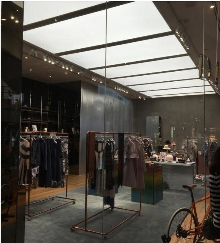
Shop - THAILAND Backlit boxes Installation: Chingchai & Sons Engineering Co.,Ltd (CCSE)

...for the advantages of CLIPSO® for walls and ceilings in commercial spaces: