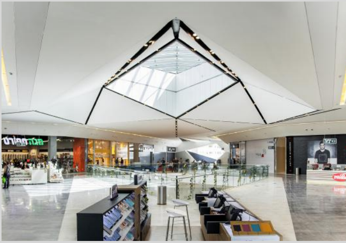
Shopping Mall AZRAILI Group - Israel XXL Acoustic Frames with Light Path Integration - Architect: Avner Sher architects - Installation: ART COVER