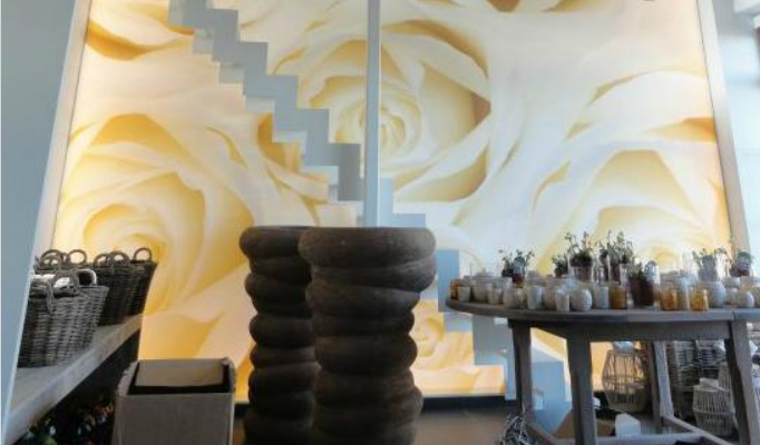
Shop - BELGIUM Printed wall - Installation: MonaVisa