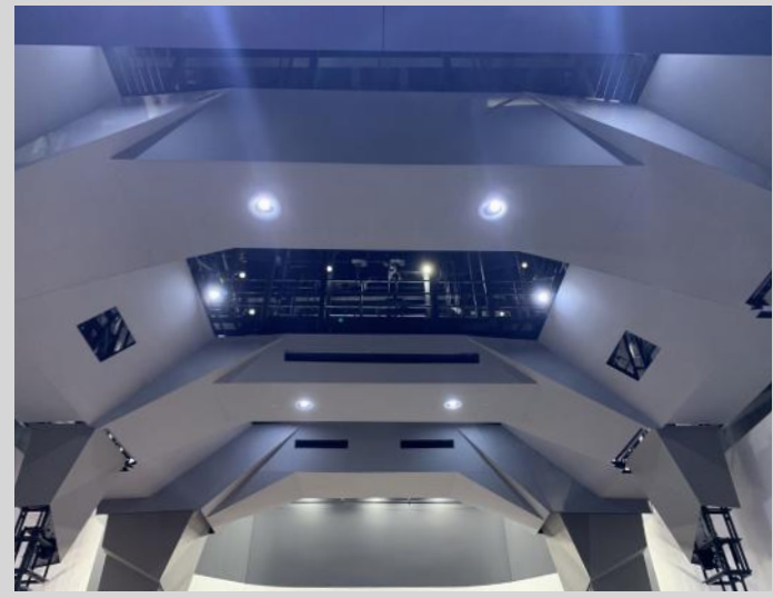
Ravinia Concert Hall - USA - Thunder grey acoustic covering with black profiles Installer: The Huff Company Architect: BJC architects

In a cinema, good acoustics are essential, which require the skill and expertise that CLIPSO can provide. Both your technical and aesthetic requirements will be met to ensure your viewers enjoy flawless sound in a pleasant environment. You can also opt for light fittings to ensure comfort and harmony in all your rooms.