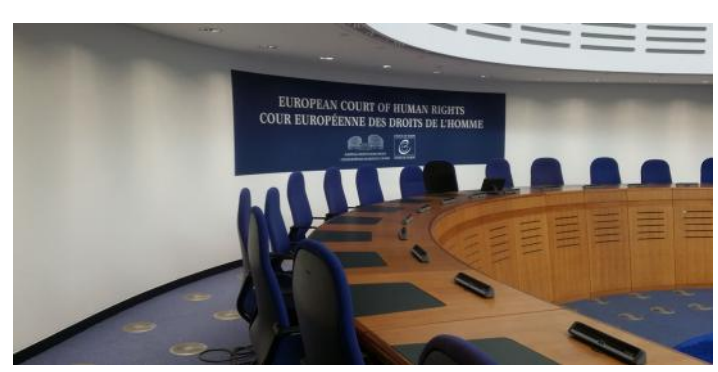
Council of Europe - FRANCE White Acoustic Wall - Installation: ATOUDECOR