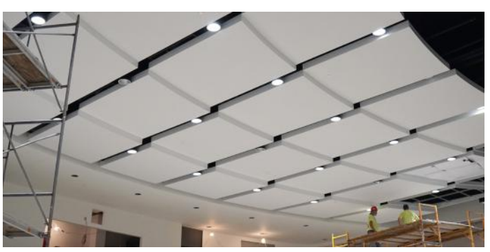
Ariel Corporation Auditorium - USA Custom acoustic frames, colour 'pepper' Installation: Ketchum & Walton Co.