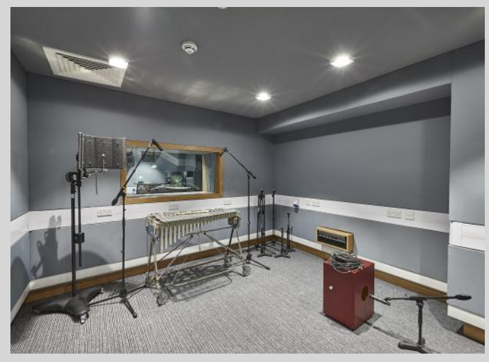
Recording Studio - UNITED KINGDOM - White ceiling and pearl grey acoustic walls - Installation: ACOUSTIC GRG