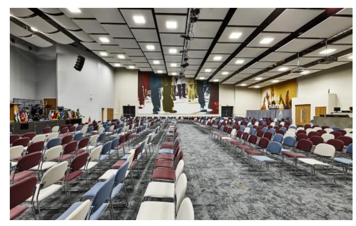
Auditorium (UNITED KINGDOM) Acoustic frames and printed walls Installation: ACOUSTIC GRG