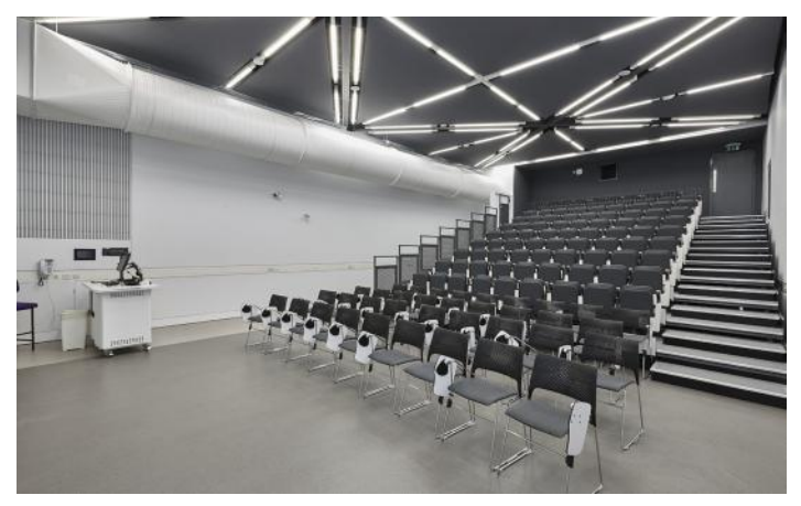
AGRG Winchester School of Art - UNITED KINGDOM Custom acoustic frames, special colour: anthracite grey Installation: Acoustic GRG

Comfort, immersion, perfect acoustics, and even the installation of a traditional cinema panoramic scene are available to provide you with an exceptional experience.