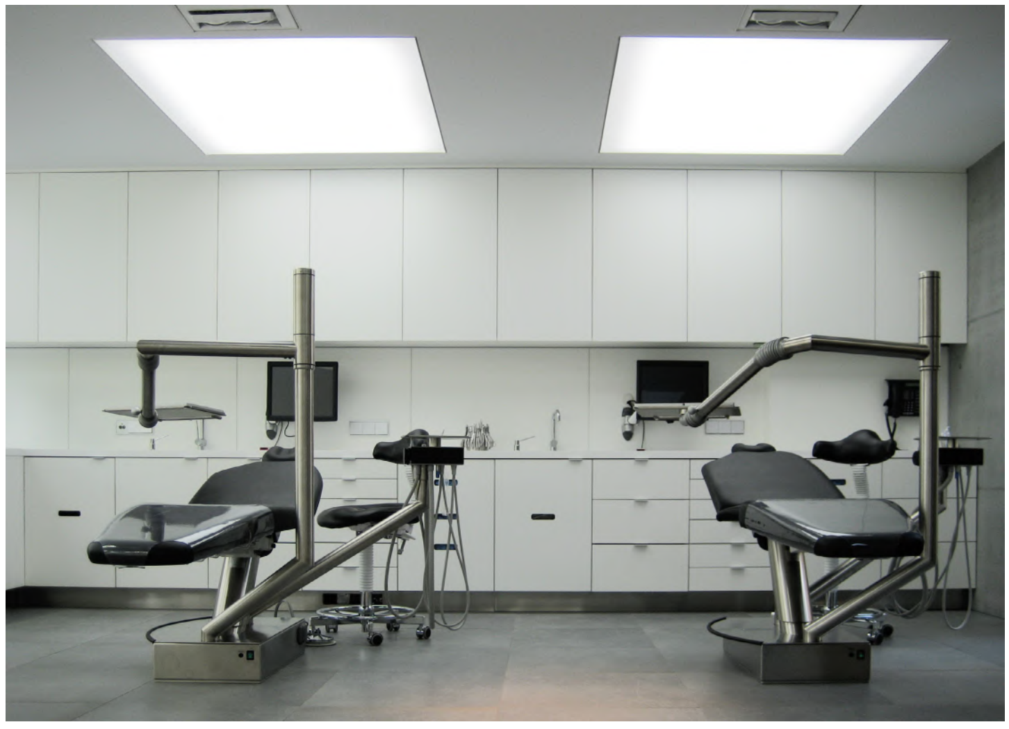
Kelderman orthodontics - THE NETHERLANDS