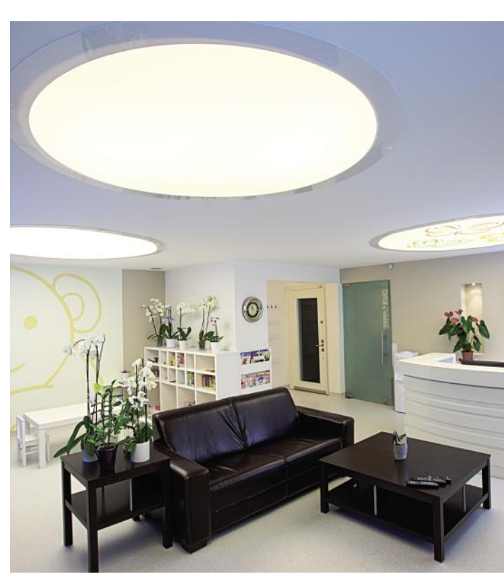
Waiting room of a medical practice - TURKEY