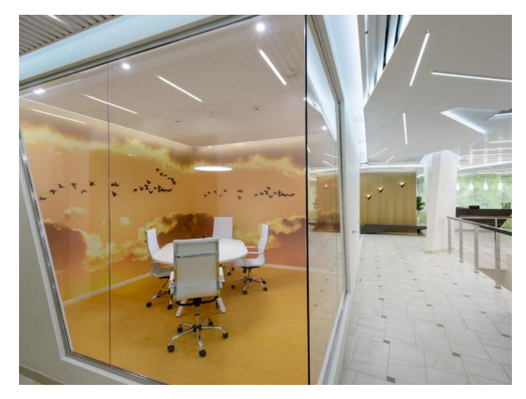
Medical Centre - RUSSIA Installation: CLIPSO UNION

CLIPSO* solutions can also equip non-sterile reception spaces with shapes and colour!