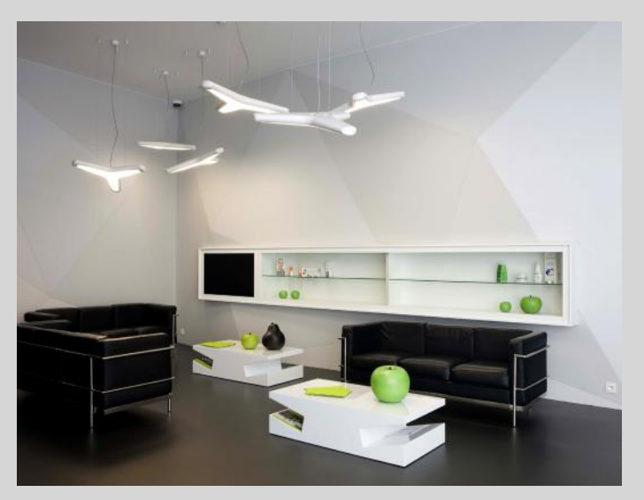
Waiting room of a medical practice - BELGIUM