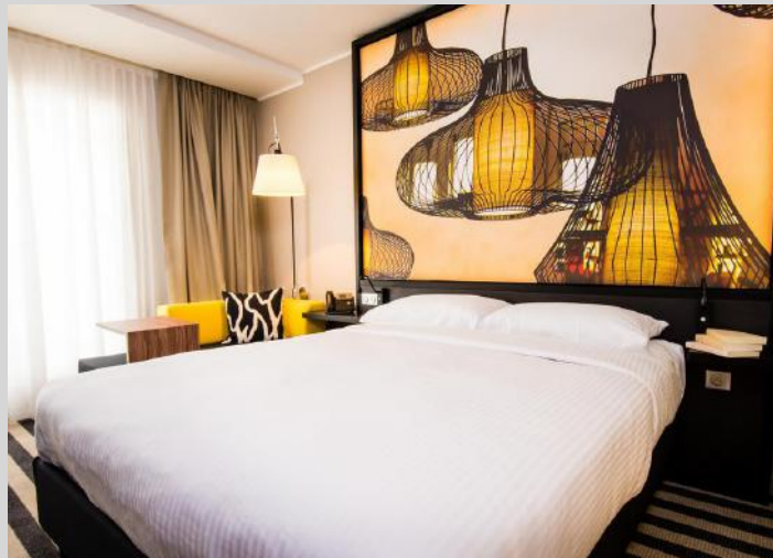
Pointe Simon Hotel - Martinique - FRANCE Printed backlit frames - Installation: DL2A