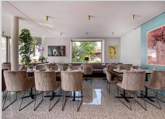
Hôtel du Léman - SWITZERLAND - White acoustic ceilings Installation: ABRUIM