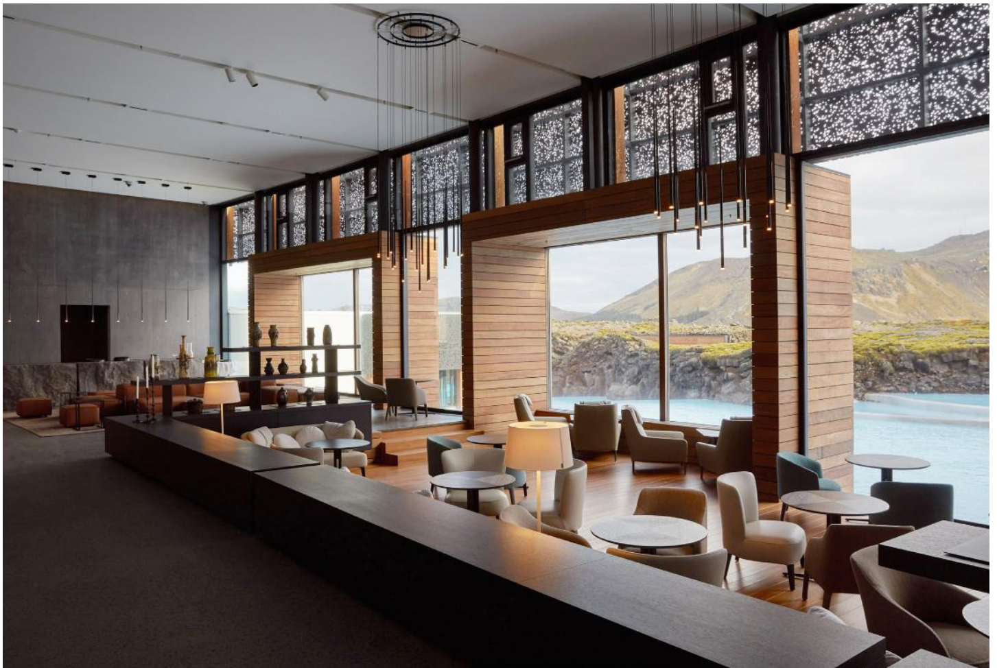
Hotel Blue Lagoon - ICELAND - White and colour acoustic ceilings - Architect: Basalt Architects - Installation: ENSO