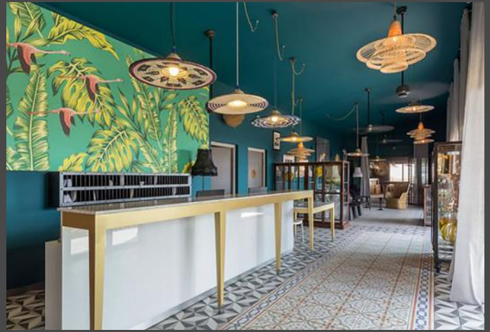
Hotel Dina Morgabine Hermitage - Reunion - FRANCE Printed wall frame - Installation: Blue Coast Installation