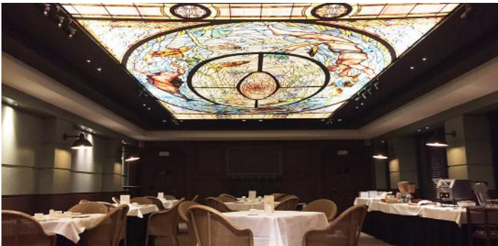
Restaurant - Belgium - Back-lit printed ceiling: MONAVISA

...for the advantages of CLIPSO® for walls and ceilings in hotels & restaurants