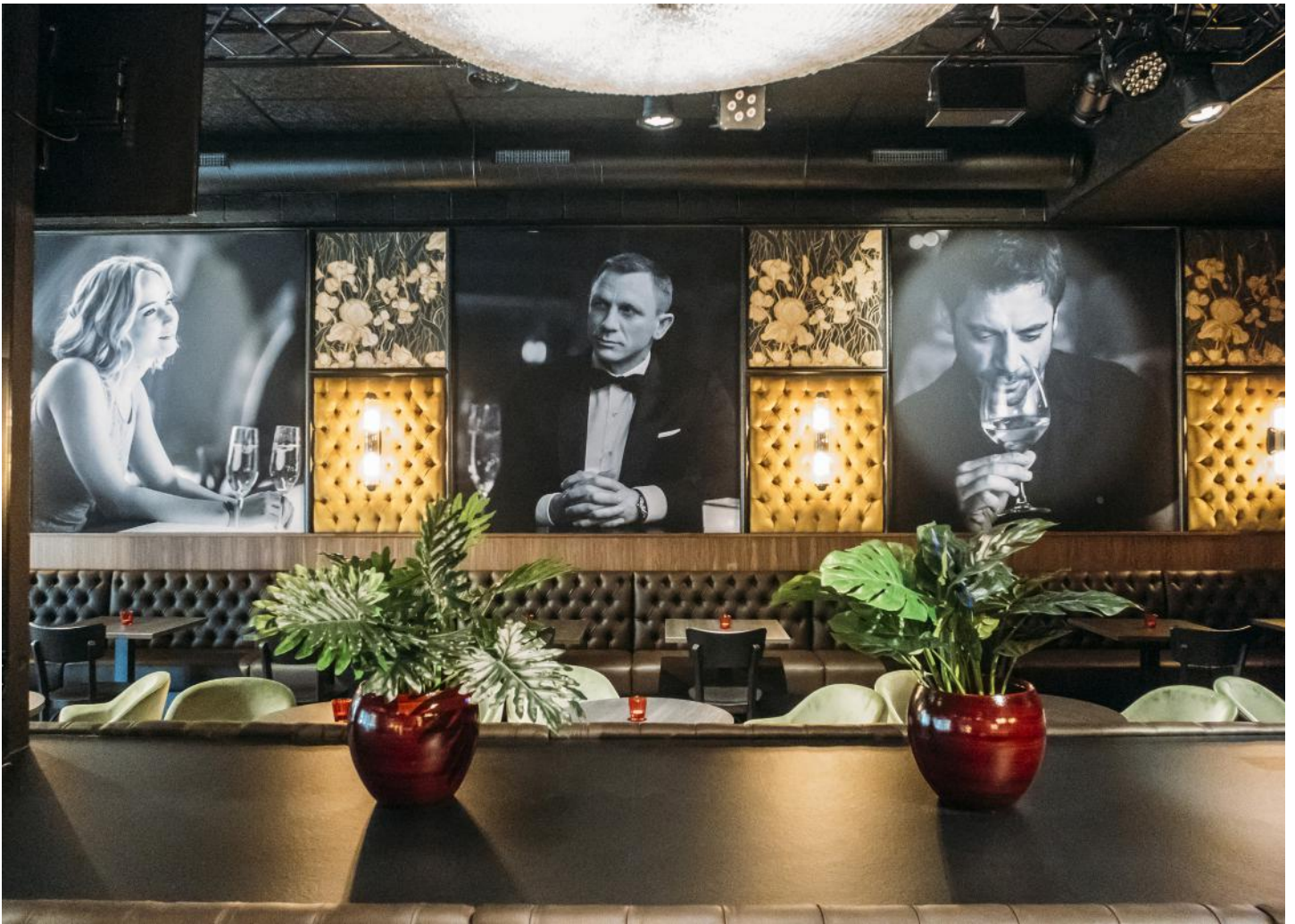
Imagix Restaurant - BELGIUM - Black & white printed wall frames - Installation : MONAVISA