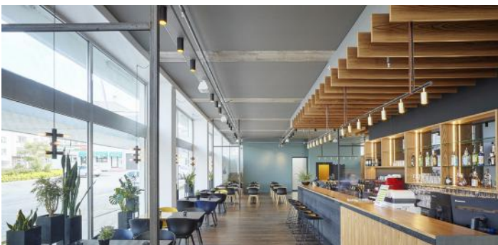
Bar - Restaurant - ICELAND - Colour acoustic ceiling Installation: ENSO