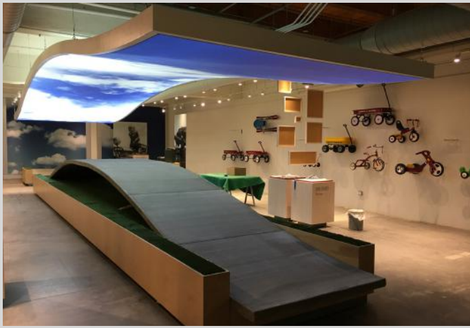
Radio Flyer Corp. HQ - Chicago, IL - USA Frame - Sky printed canvas, backlit Installation : The Huff Company, Inc.