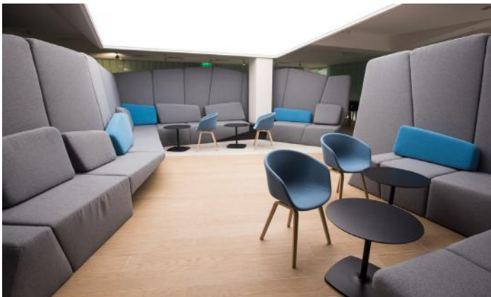
VIP Lounge of Koltsovo Airport - RUSSIA White acoustic canvas and backlit units Installation: CLIPSO UNION

of the day, the acoustic decorative print has had quite an impact on customers. It also enabled us to hide the technical lighting and fire protection elements. The profile system will eventually make it possible to modify the decoration over and over!"