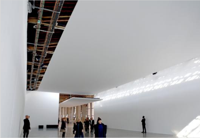
Anywhere, Anywhere Out of The World exhibition at the Palais de Tokyo - Paris - FRANCE - Suspended acoustic ceilings Artist: Philippe Parreno - Installation : CLIPSO