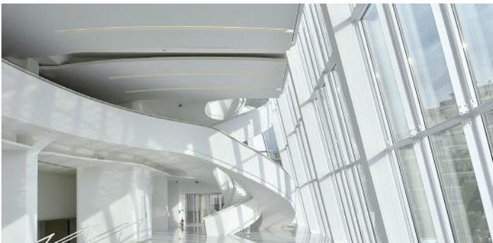
Palais des Festivals of Cannes - FRANCE Acoustic ceiling white - Installation: Prestations BTP

...for the advantages of CLIPSO® for walls and ceilings in Public spaces