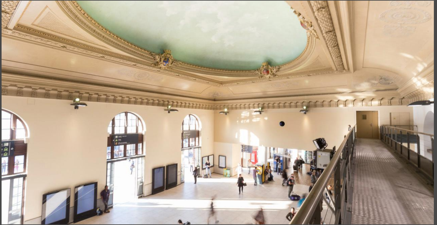
Nice train station - FRANCE - "Straw" colour acoustic walls - Installation: CLIBATE

"The refurbishment of a station generates two major problems: providing users with the continuity of service and working as cleanly as possible. Installing CLIPSO® fabrics was a global solution with the assurance of a very short installation time. At the end