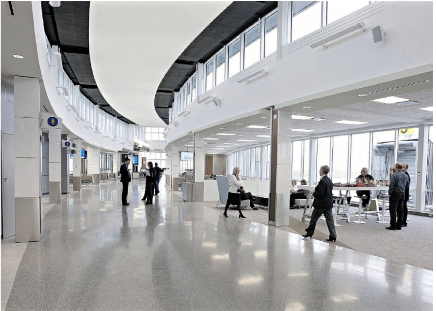
Expansion of Saskatoon International Airport - CANADA Acoustic ceilings - Architect: Kindrachuk Agrey Architecture - Installation: Snap-Tex Canwest