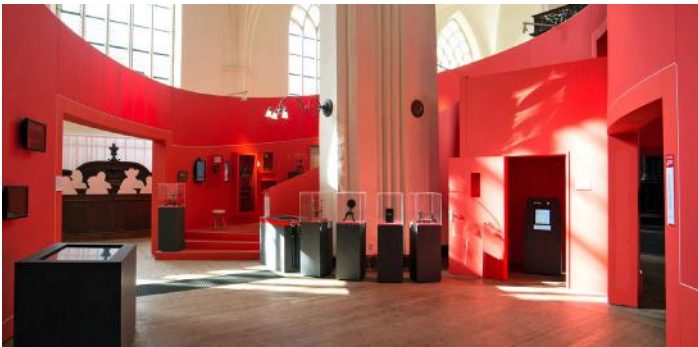
"400 years of science" Exhibition, Aa-Kerk Church - Groningen THE NETHERLANDS - Presentation of the exhibition stand (500m²) Architect: Kloosterboer Decor - Installation: City Outdoor Media