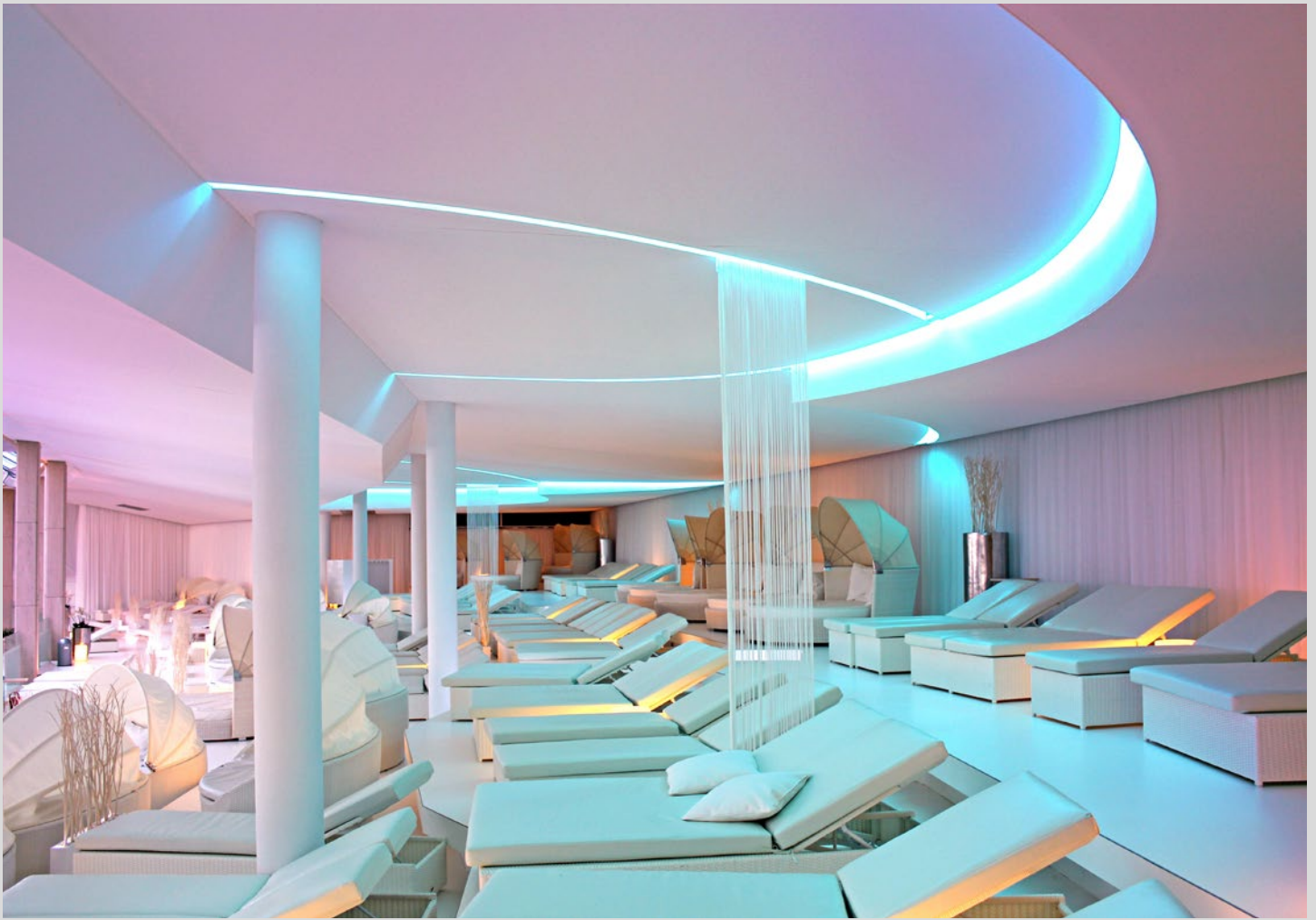
Badewelt aquatic center - Sinsheim - Germany