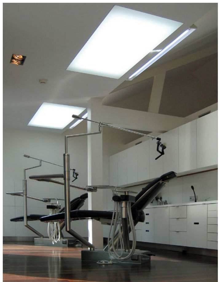
Kelderman Orthodontics - Architect : ARHK