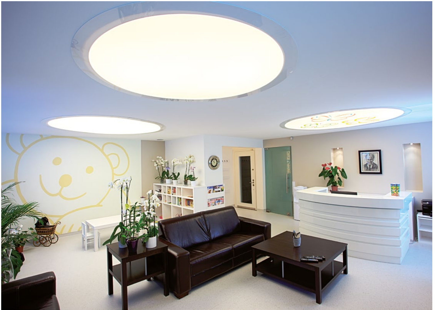
Medical office waiting room - Turkey