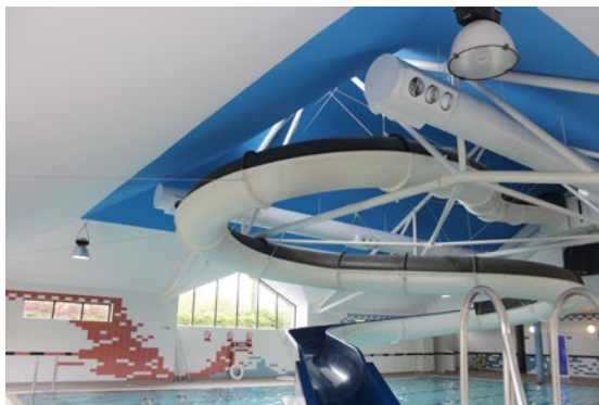
Swimming pool, leisure area - United Kingdom

SO CLEAN adequately meets the specific requirements for hospitals, doctors' surgeries and waiting rooms, as well as swimming pools and spas, by actively helping to create a safe, reassuring environment.