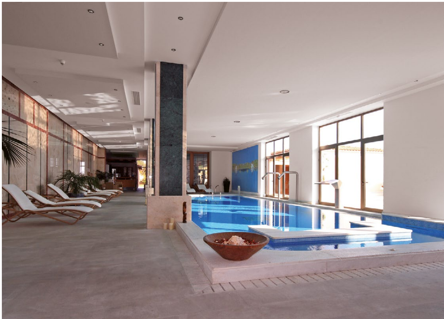
Swimming pool, wellness center