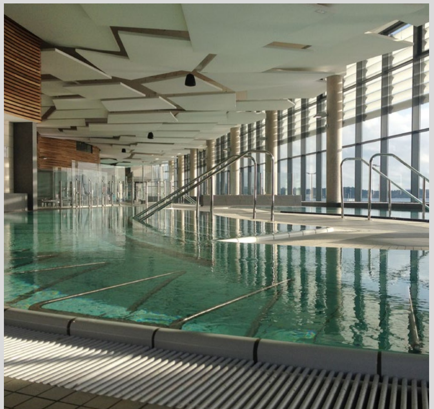
Baths of Balaruc - France

Sanitized® -treated SO CLEAN stretched walls and ceilings therefore are, and remain, free of mites. As it is an actual antibacterial and antifungal barrier, Sanitized® delivers long-term action and effectiveness, even after exposure to disinfectants.