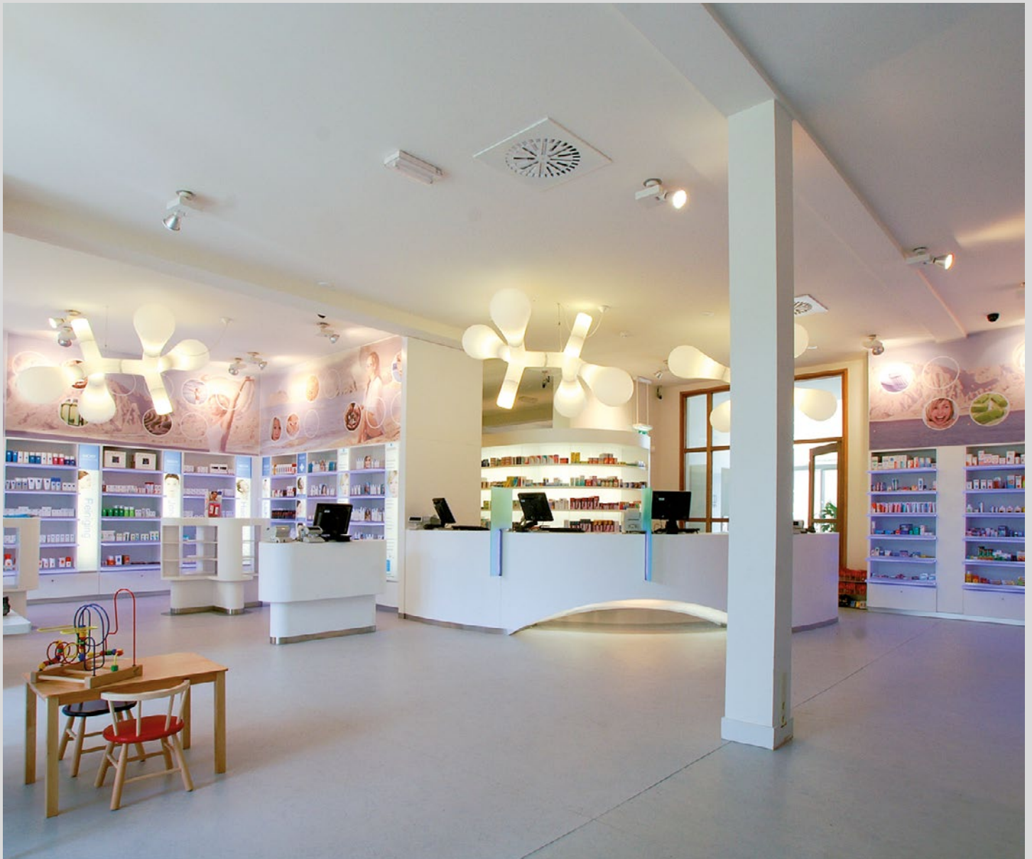
Pharmacy - Germany