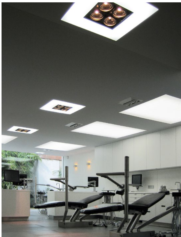
Kelderman Orthodontics - Architect : ARHK