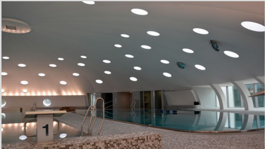
Lingolsheim swimming pool - France