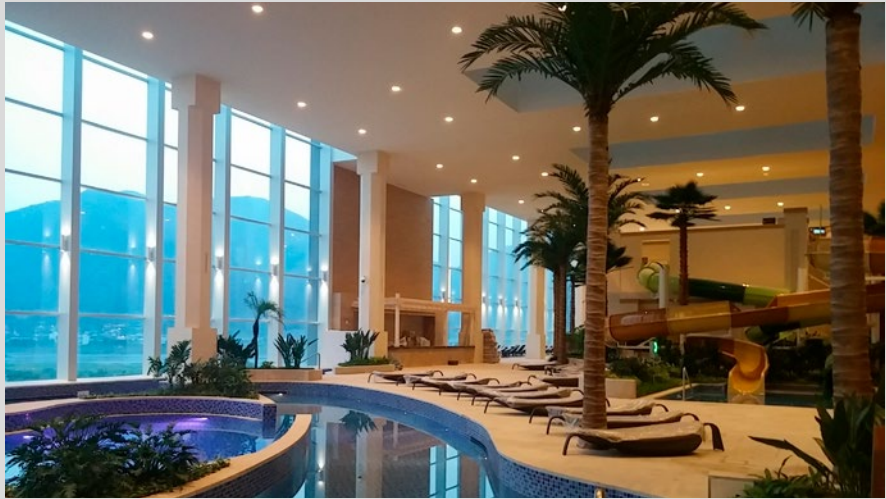
Swimming pool - Ceiling - Korea