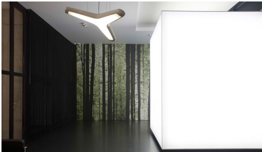
Medical office - Belgium

Managing noise also means creating a different, quieter ambiance, a definite asset when it comes to the comfort of your waiting rooms and surgeries.