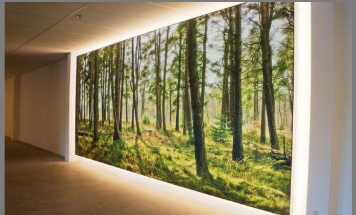
Wall box - Backlit printed covering - Belgium Application : City Outdoor