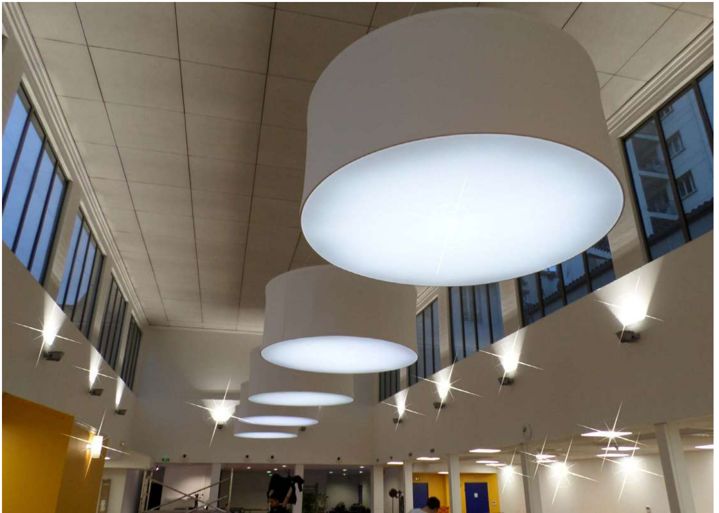
Shopping mall - XXL light fixtures in aluminum structure - Backlit coverings - France - Application : SPIDER DESIGN

Light is necessary, even vital to regulates our body and mood.