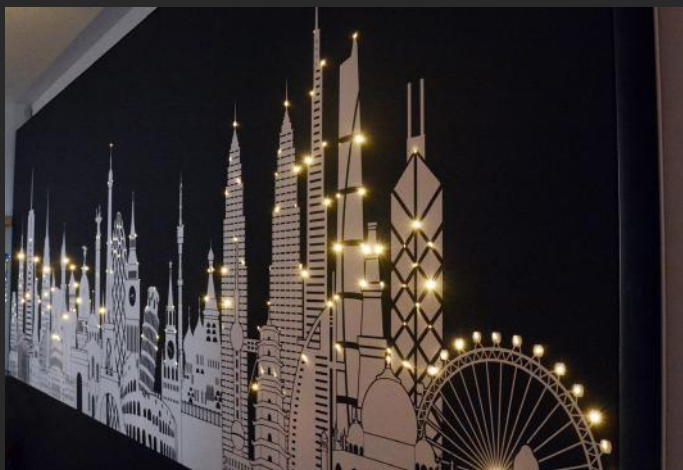
Printed wall with integrated optical fiber - France Application : CLIPSO PRODUCTION

On walls or ceilings, you create a unique atmosphere that makes you dream.