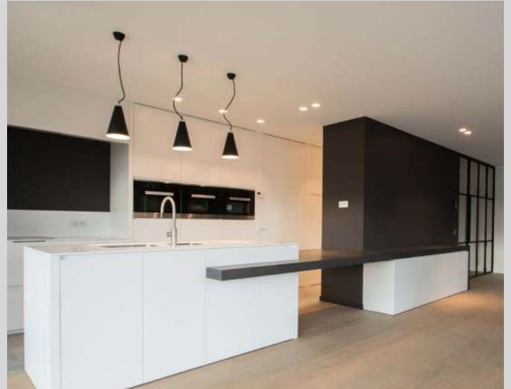
Private house - Acoustic ceiling with spots integration Belgium - Application : MONAVISIA

Showcase your products in your stores and showrooms with modern and immaculate light.