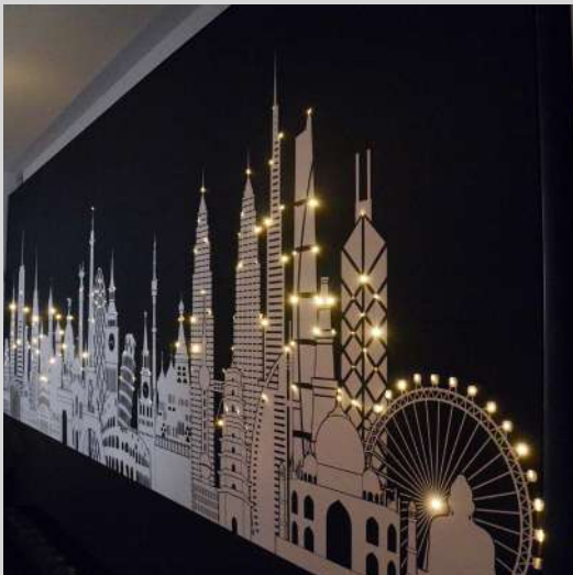
Printed wall with integrated optical fiber - France Application : CLIPSO PRODUCTION

Dream under the stars with the optical fibers embedded in our fabrics! On walls or ceilings, you create a unique atmosphere that makes you dream.