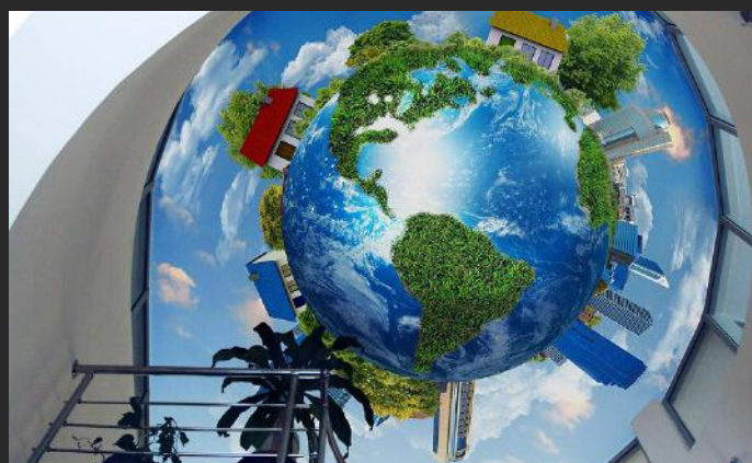
Backlit trompe-l'oeil ceiling - Germany Application : Baumann