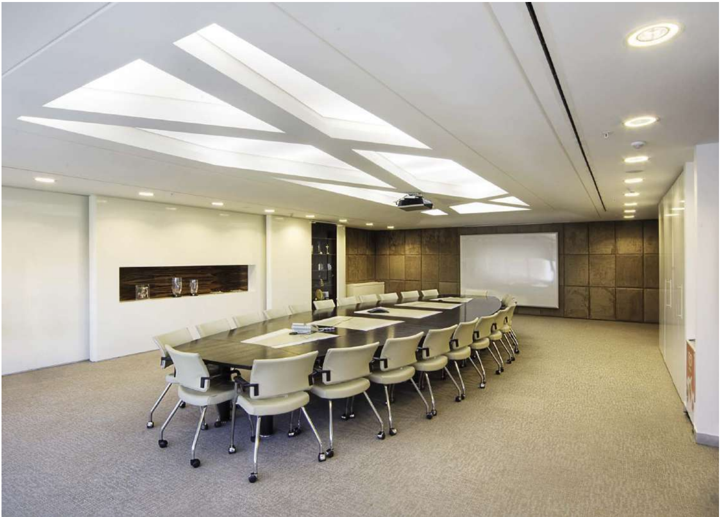
Meeting room UNILEVER - Ceiling and backlit structure