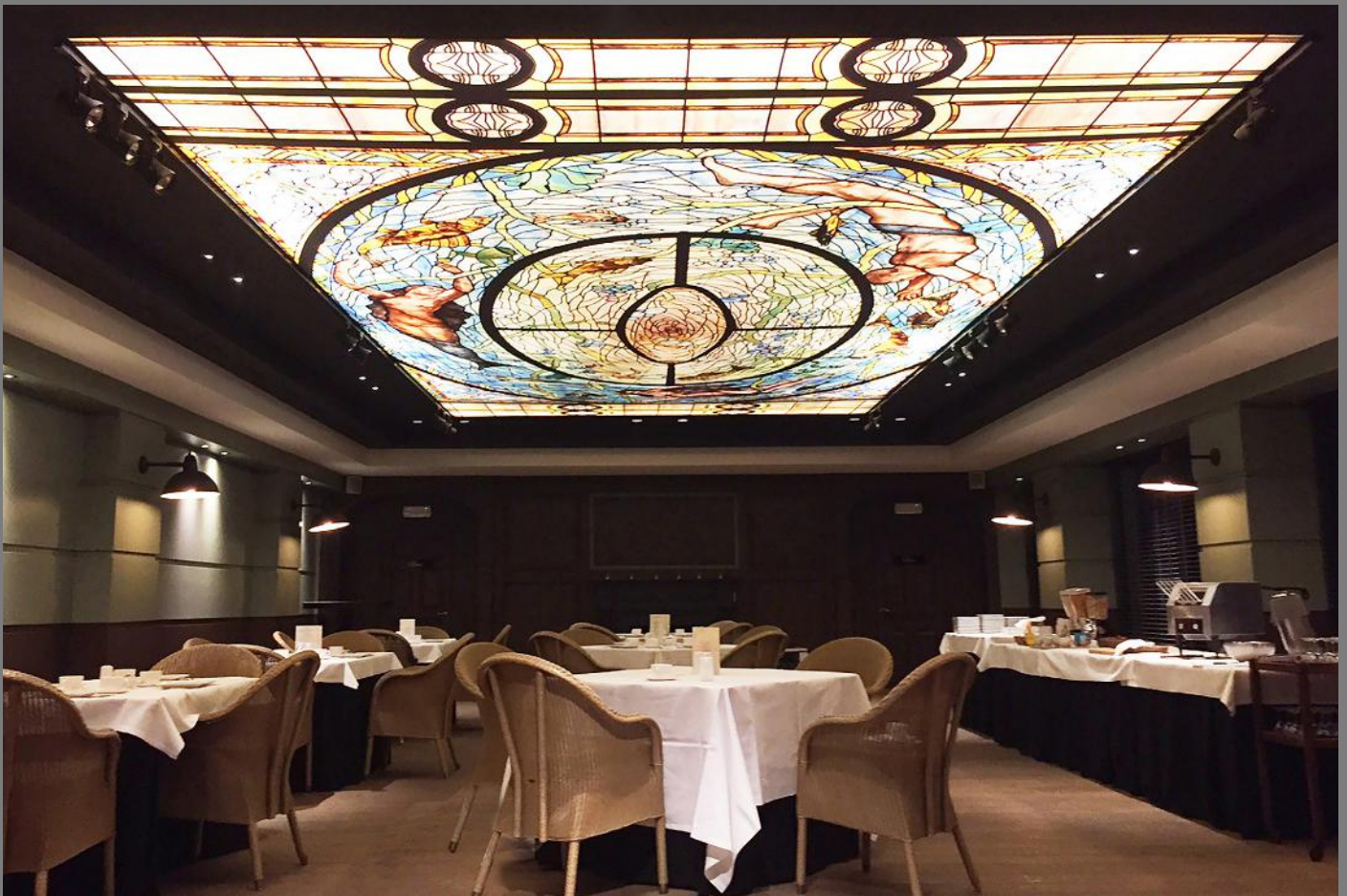
Restaurant - Backlit printed covering - Belgium - Application : MONAVISIA