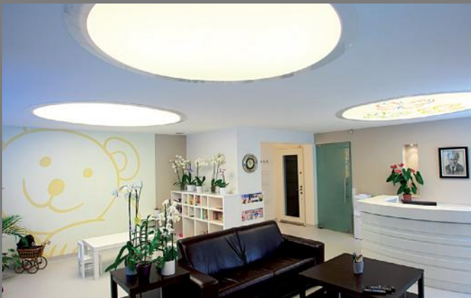
Dental clinic - Ceiling with backlit circles

SHOPPING MALL - XXL LIGHT FIXTURES IN ALUMINUM STRUCTURE - BACKLIT COVERINGS - FRANCE APPLICATION : SPIDER DESIGN