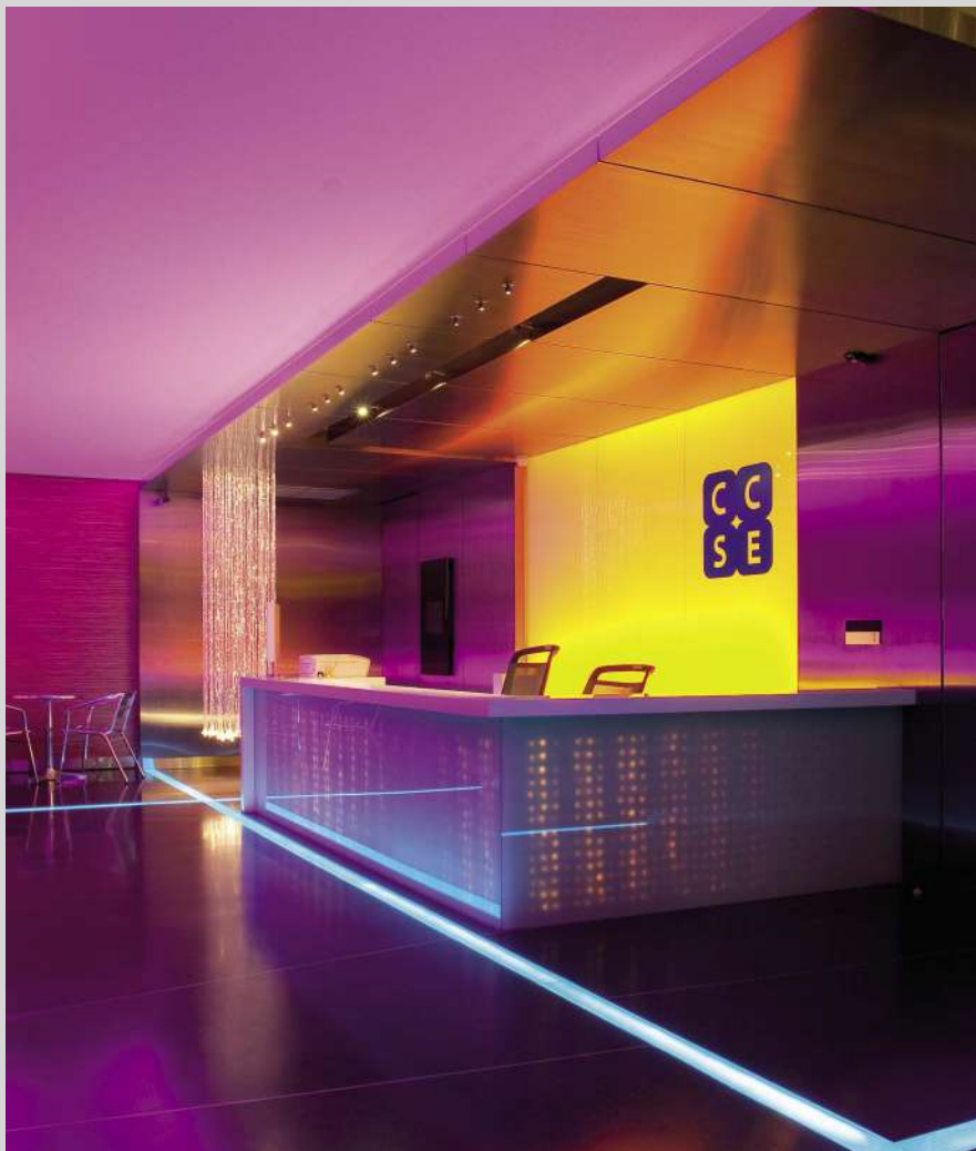
Reception desk - Backlit RGB coverings - Thailand - Application : CCSE