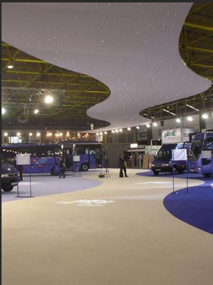
IVECO booth - Ceiling with integrated optical fiber