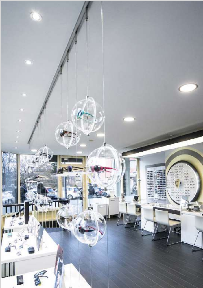
Optical store - Spots and backlit boxes integration Germany - Application : Optimaler

Embellish your entire space with a luminous effect that simulates daylight.