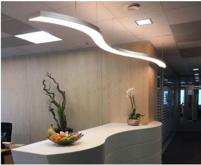
Backlit aluminum structures - Light Fixture - Switzerland Application : Linsi-tech

The compatibility of LED with our fabric gives you total customization: a printed coating with your choice of images or an artist's creation will create a unique atmosphere.