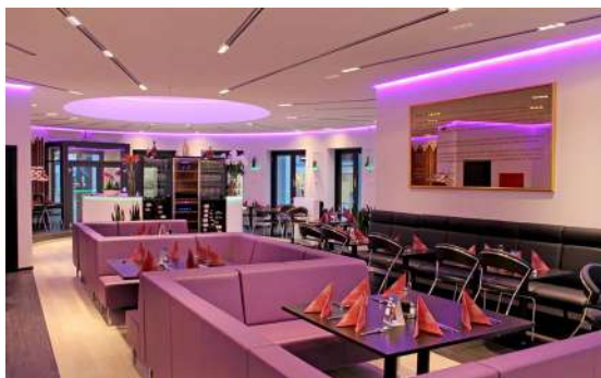
Restaurant - Acoustic ceiling with light path integration and backlight - Denmark Application : RALBO

The brightness as for it, depends on the perception we have at the moment. It's therefore essential today to adapt our interiors, workplaces as our "home", to evolve in a pleasant atmosphere that fits us.