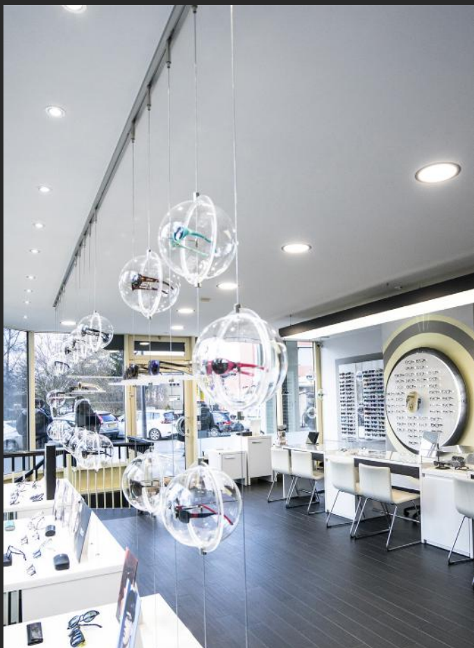
Optical store - Spots and backlit boxes integration Germany - Application : Optimaler