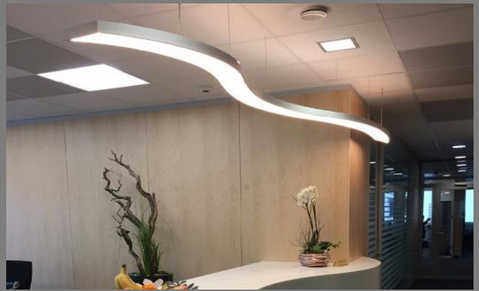
Backlit aluminum structures - Light Fixture - Switzerland Application : Linsi-tech

This shape will be modern, elegant, aesthetic or refined ... Conform to your desires!