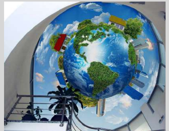
Backlit trompe-l'oeil ceiling - Germany Application : Baumann

Some public spaces are now designed to make acoustics as pleasant as possible, shopping malls in which ubiquitous noise must be mitigated, or medical practices where discretion is required.