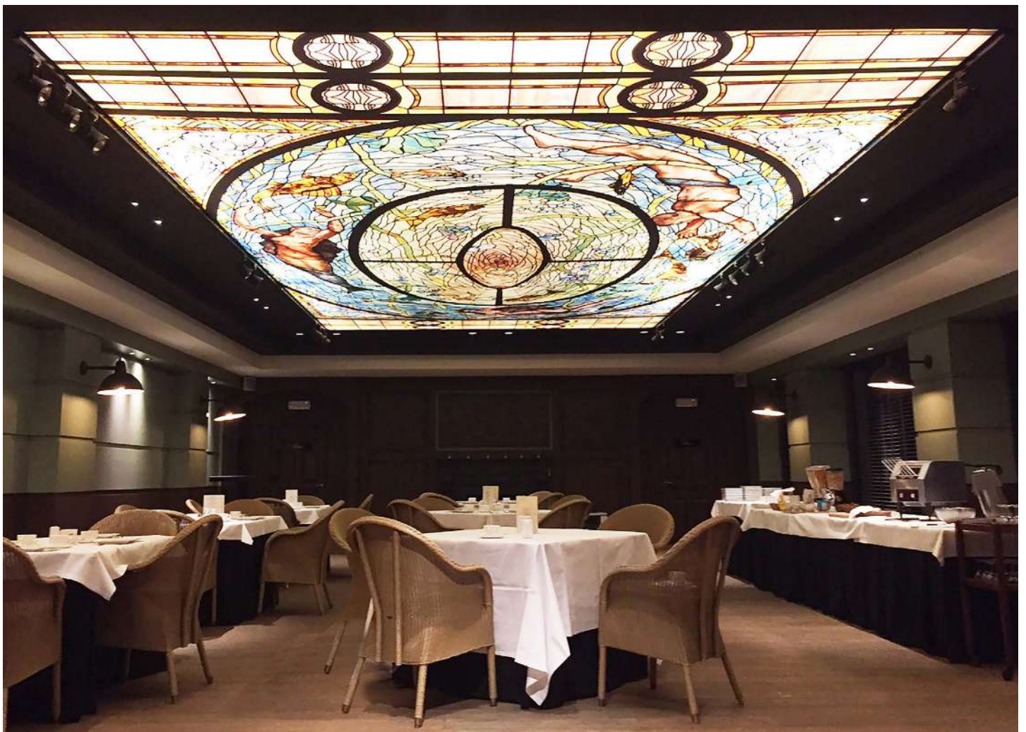
Restaurant - Backlit printed covering - Belgium - Application : MONAVISA

This shape will be modern, elegant, aesthetic or refined ... Conform to your desires!