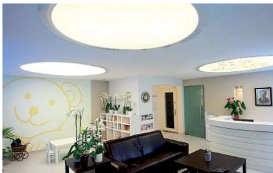
Dental clinic - Ceiling with backlit circles

Light is necessary, even vital to regulates our body and mood.