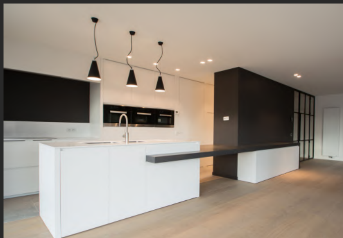
Private house - Acoustic ceiling with spots integration Belgium - Application : MONAVISA

Embellish your entire space with a luminous effect that simulates daylight.