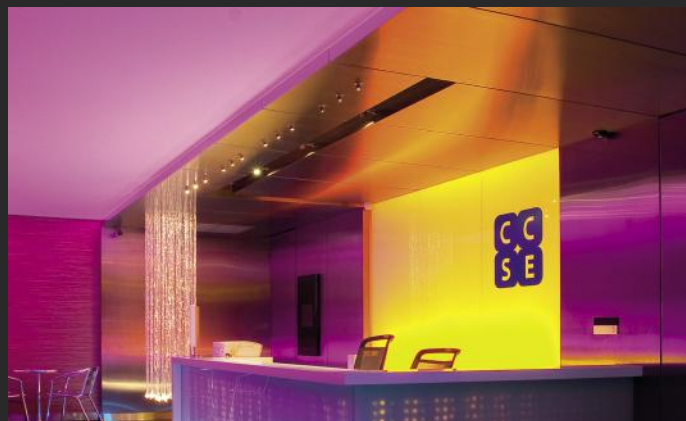
Reception desk - Backlit RGB coverings - Thailand - Application : CCSE

Some public spaces are now designed to make acoustics as pleasant as possible, shopping malls in which ubiquitous noise must be mitigated, or medical practices where discretion is required.