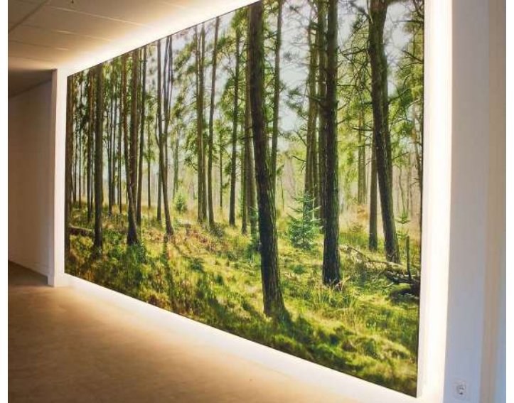
Wall box - Backlit printed covering - Belgium Application : City Outdoor

Want to play on light intensity or colors? Here again the association of a certain type of LED will allow you to create this soft and warm personalized atmosphere.