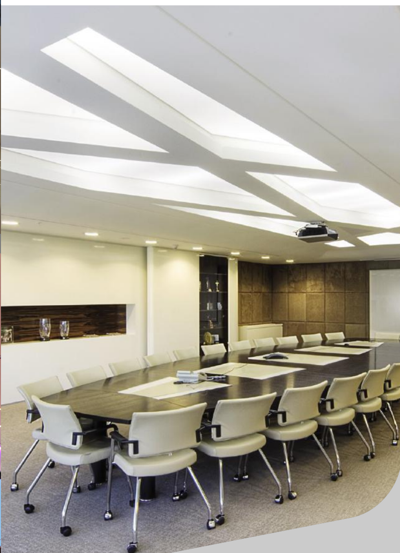
Meeting room UNILEVER Ceiling and backlit structure

The success of your achievement is our requirement.