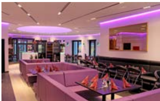
Restaurant - Acoustic ceiling with light path integration and backlight - Denmark Application : RALBO

The brightness as for it, depends on the perception we have at the moment. It's therefore essential today to adapt our interiors, workplaces as our "home", to evolve in a pleasant atmosphere that fits us.