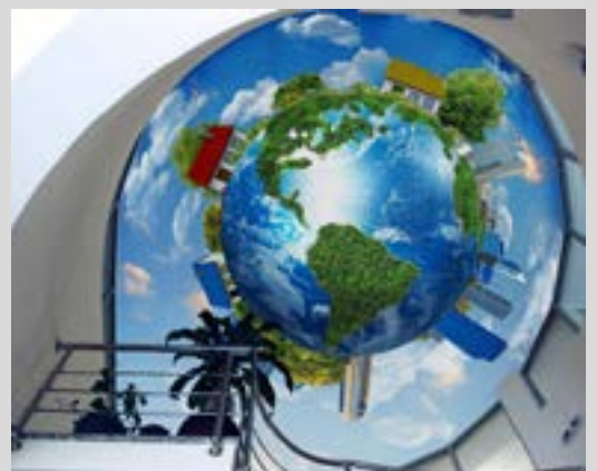
Backlit trompe-l'oeil ceiling - Germany Application : Baumann

Some public spaces are now designed to make acoustics as pleasant as possible, shopping malls in which ubiquitous noise must be mitigated, or medical practices where discretion is required.