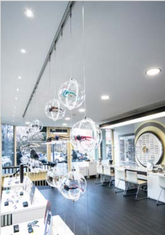
Optical store - Spots and backlit boxes integration Germany - Application : Optimaler

Embellish your entire space with a luminous effect that simulates daylight.