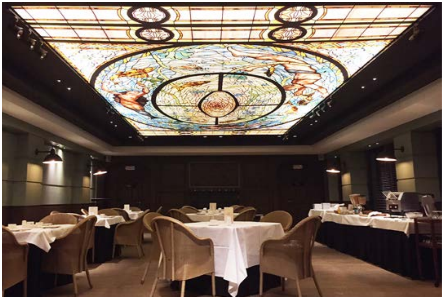
Restaurant - Backlit printed covering - Belgium - Application : MONAVISIA

Our workshops will create the lighting you need, we will design for you the most suitable shape and offer various light intensities. This shape will be modern, elegant, aesthetic or refined ... Conform to your desires!