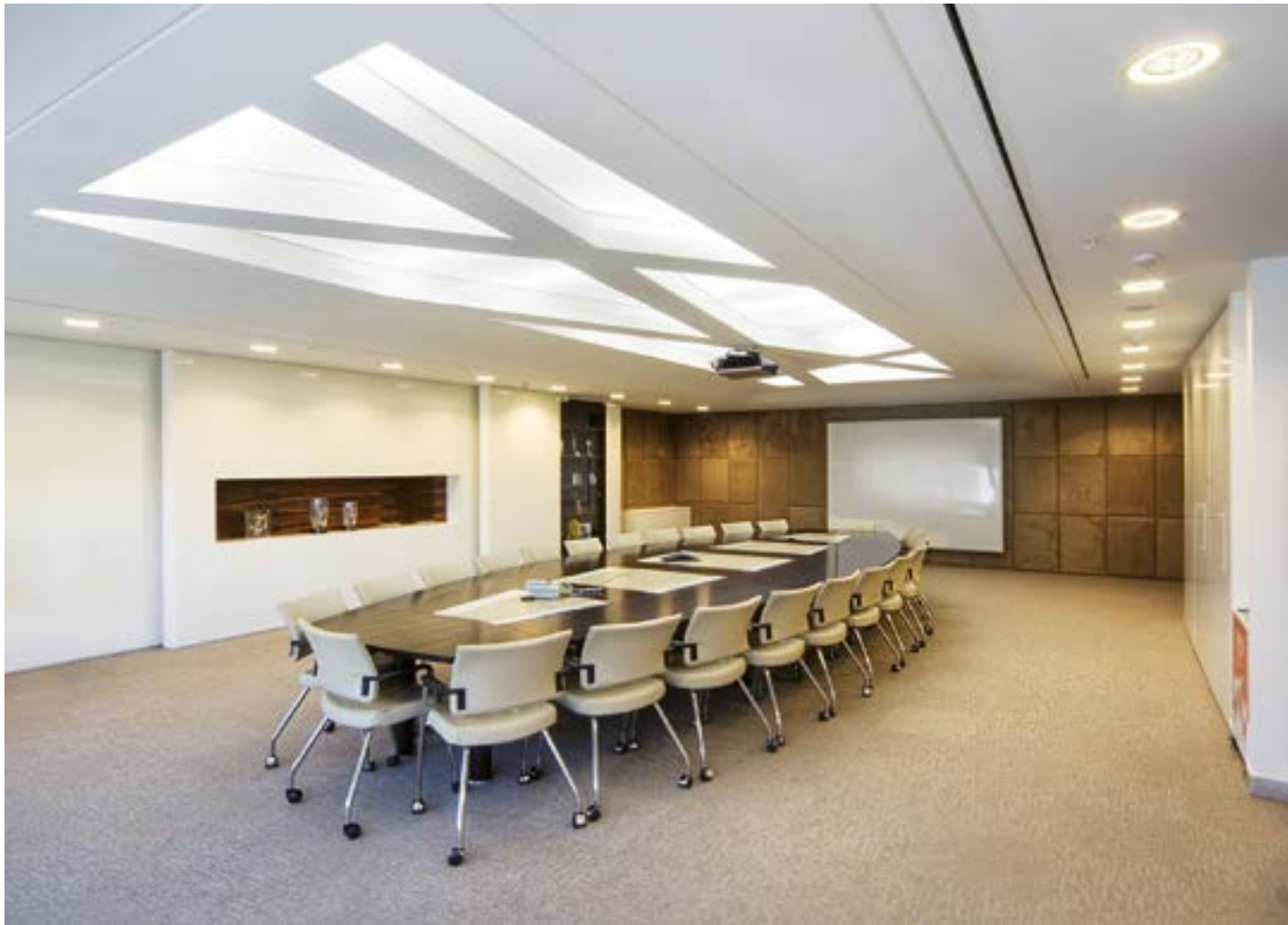
Meeting room UNILEVER - Ceiling and backlit structure