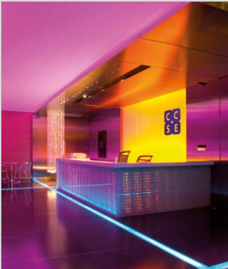
Reception desk - Backlit RGB coverings - Thailand - Application : CCSE