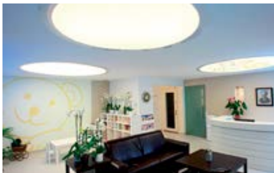
Dental clinic - Ceiling with backlit circles

Light is necessary, even vital to regulates our body and mood.