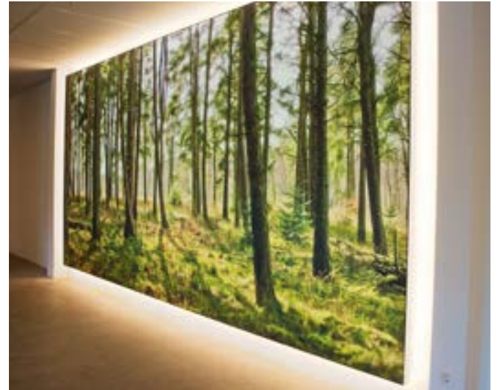
Wall box - Backlit printed covering - Belgium Application : City Outdoor

The compatibility of LED with our fabric gives you total customization: a printed coating with your choice of images or an artist's creation will create a unique atmosphere.