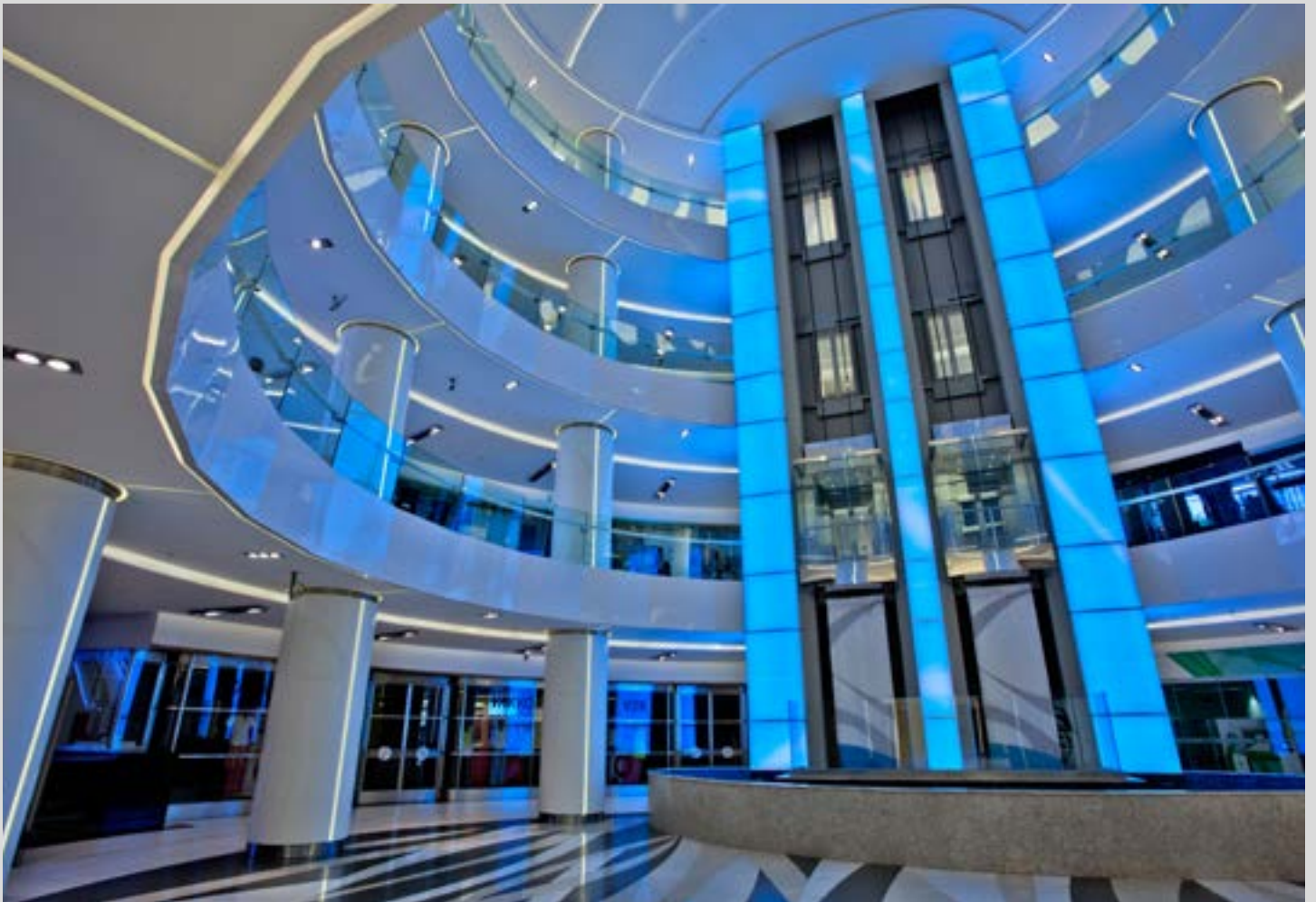
Shopping mall Akmerkez - Backlit covering - Turkey - Architect : Filiz Yilmaz - Application : TTI Elektrik Elektronik