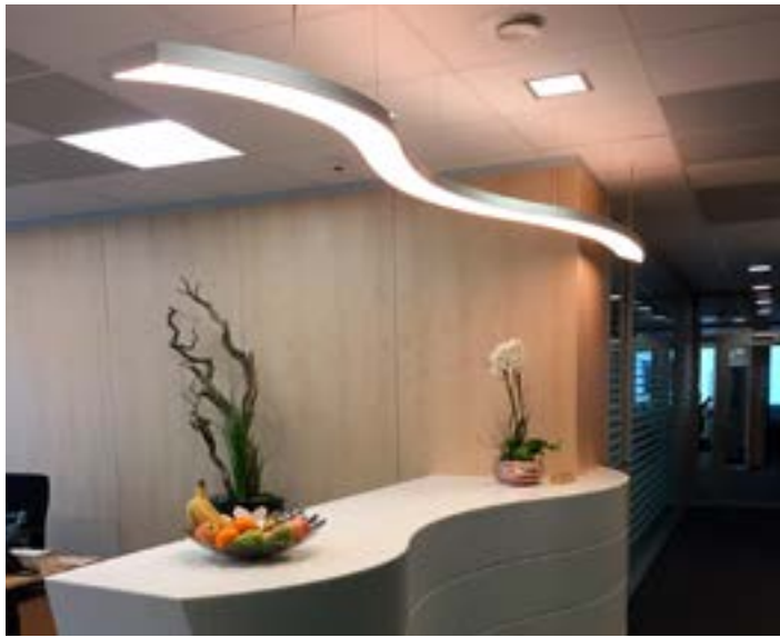
Backlit aluminum structures - Light Fixture - Switzerland Application : Linsi-tech