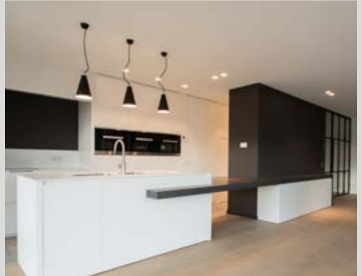
Private house - Acoustic ceiling with spots integration Belgium - Application : MONAVISIA

Showcase your products in your stores and showrooms with modern and immaculate light.