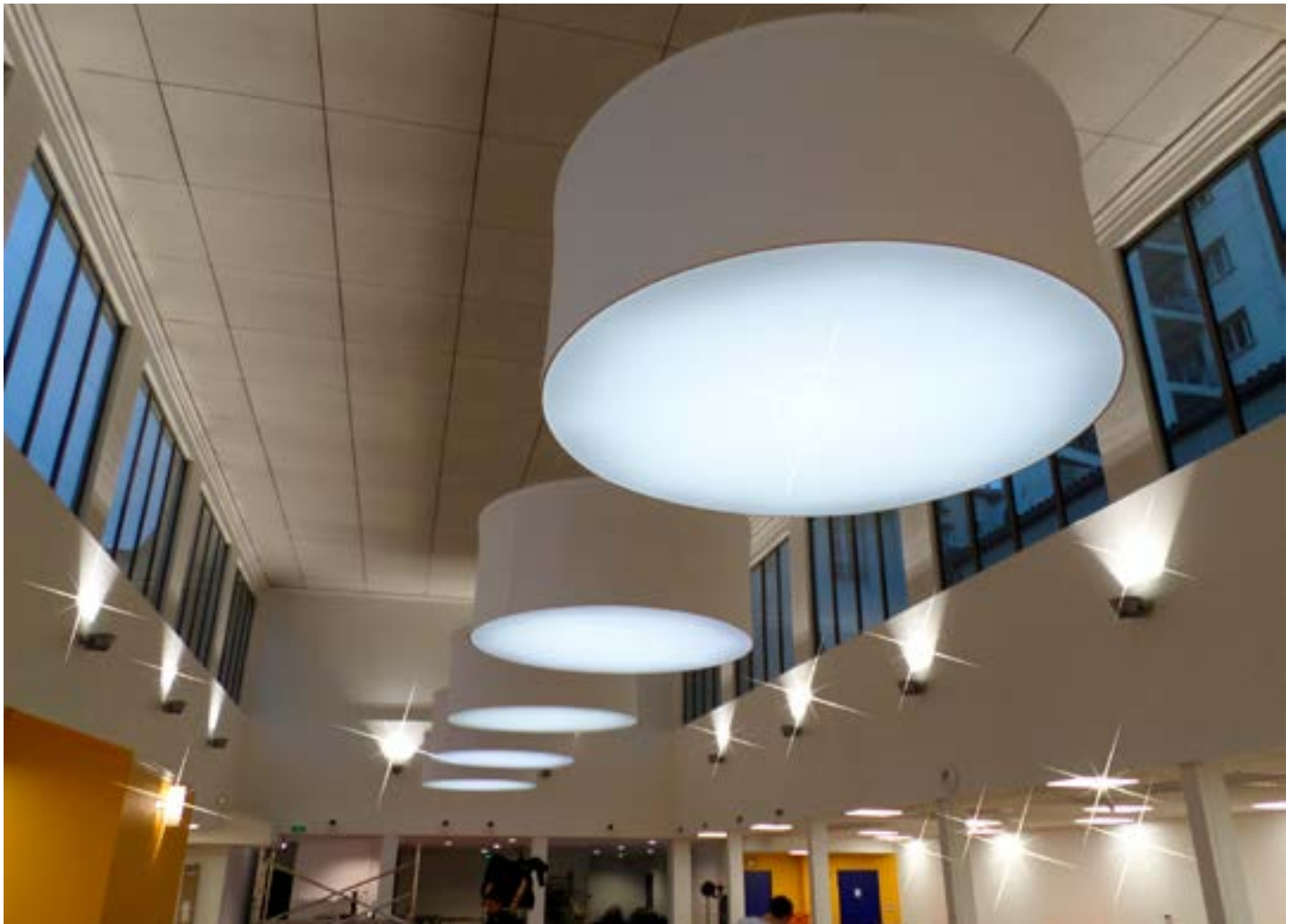
Shopping mall - XXL light fixtures in aluminum structure - Backlit coverings - France - Application : SPIDER DESIGN

Light is necessary, even vital to regulates our body and mood.