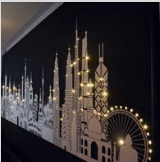
Printed wall with integrated optical fiber - France Application : CLIPSO PRODUCTION

Dream under the stars with the optical fibers embedded in our fabrics! On walls or ceilings, you create a unique atmosphere that makes you dream.