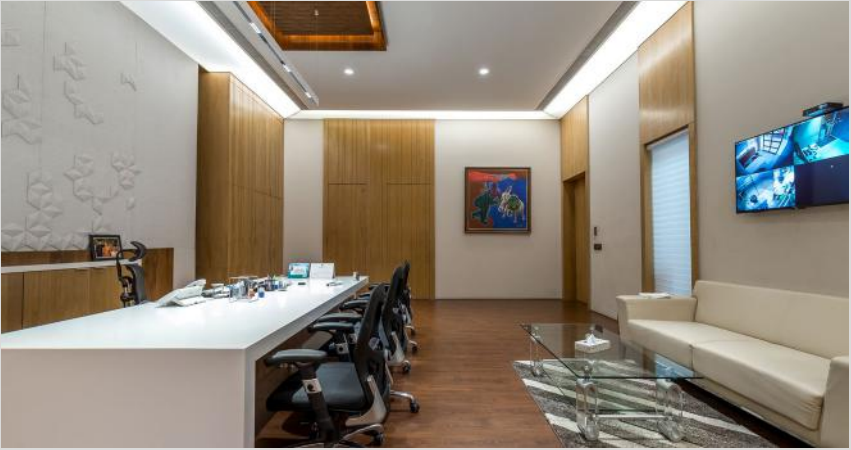
Offices - INDIA - White ceiling with light integration and backlit frame - Installation: Nakshatra