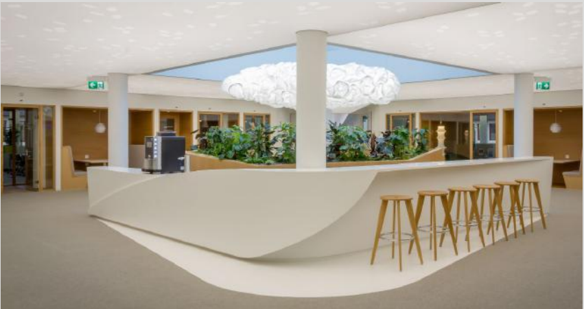
NESTLÉ Research Centre - SWITZERLAND - Printed Backlit Ceiling and printed wall panels - Architect: BRÖNNIMANN & GOTTREUX Architects SA - - Installation: ABRIMUM