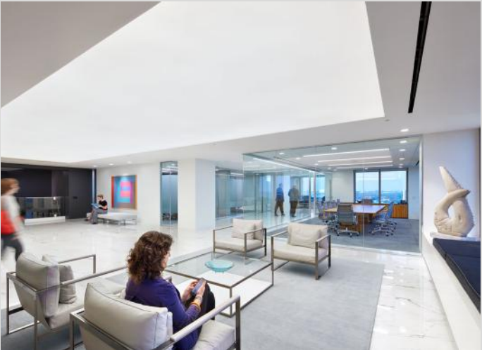
Brook Pierce Law Firm Offices - USA Translucent ceiling - Installation: WARCO Construction, Inc.

These partitions also have the advantage of being decorative. We were able to customise them and make them a communication support for our brand. Our employees are delighted with this cosy and studious atmosphere that allows them to focus effectively without isolating themselves completely from each other. CLIPSO® partitions met all our requirements in no time. ”