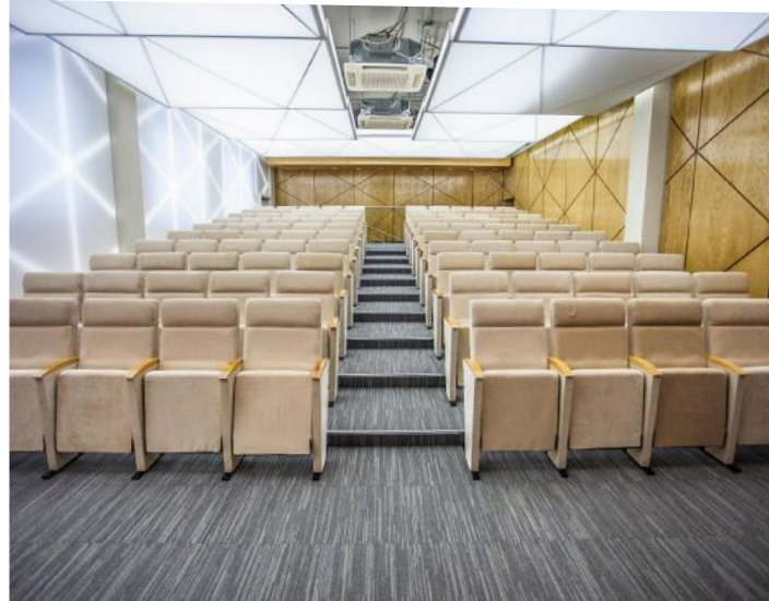
Conference room - RUSSIA - Backlit hanging frames and backlit printed walls - Installation: CLIPSO UNION

The illumination allows a uniform distribution of the light with possibilities of modulation and variation. Not to mention the undeniably advantageous value for money. What's more, with the speed of installation, performed in a few hours in the evening, we avoided tying up our conference room and disrupting the work of our teams. "