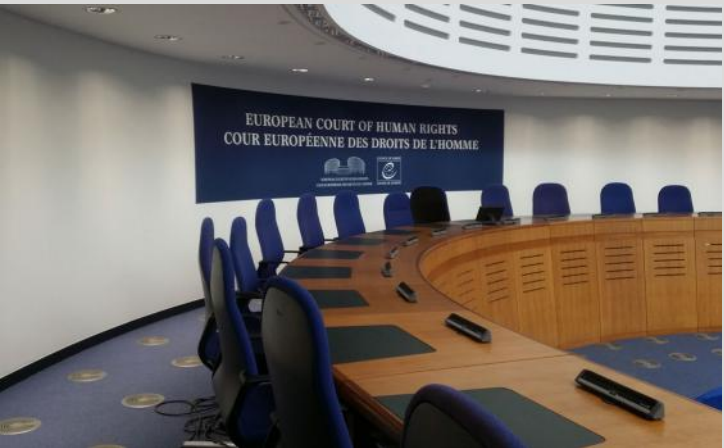
Council of Europe - FRANCE White acoustic wall - Installation : ATOUDECOR