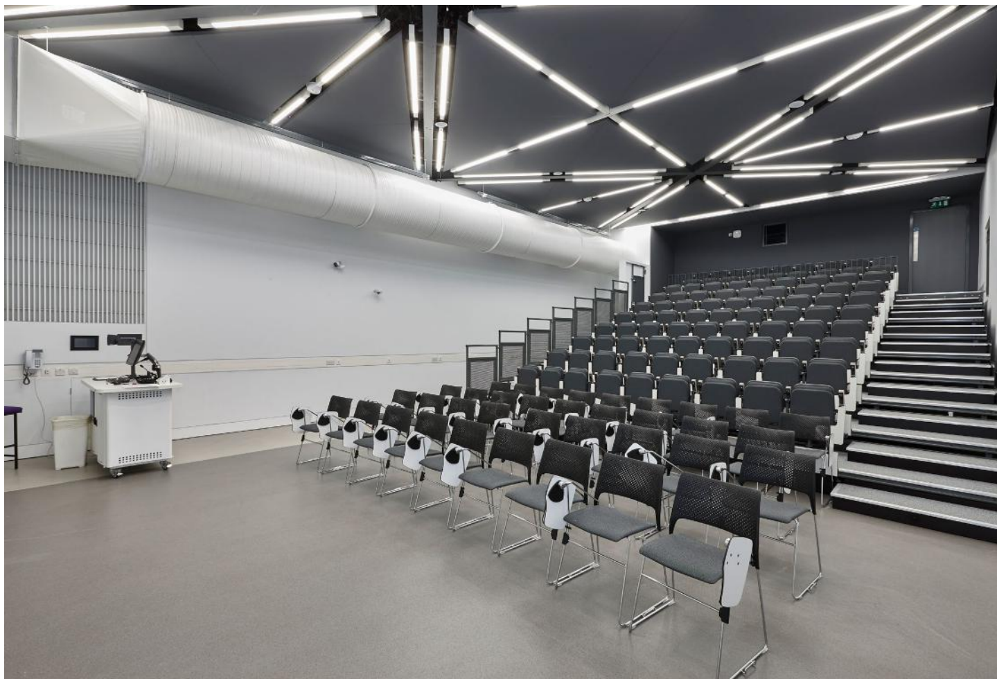
AGRG Winchester School of Art - THE UNITED KINGDOM - Acoustic custom-made frames in a special anthracite grey colour Installation: Acoustic GRG