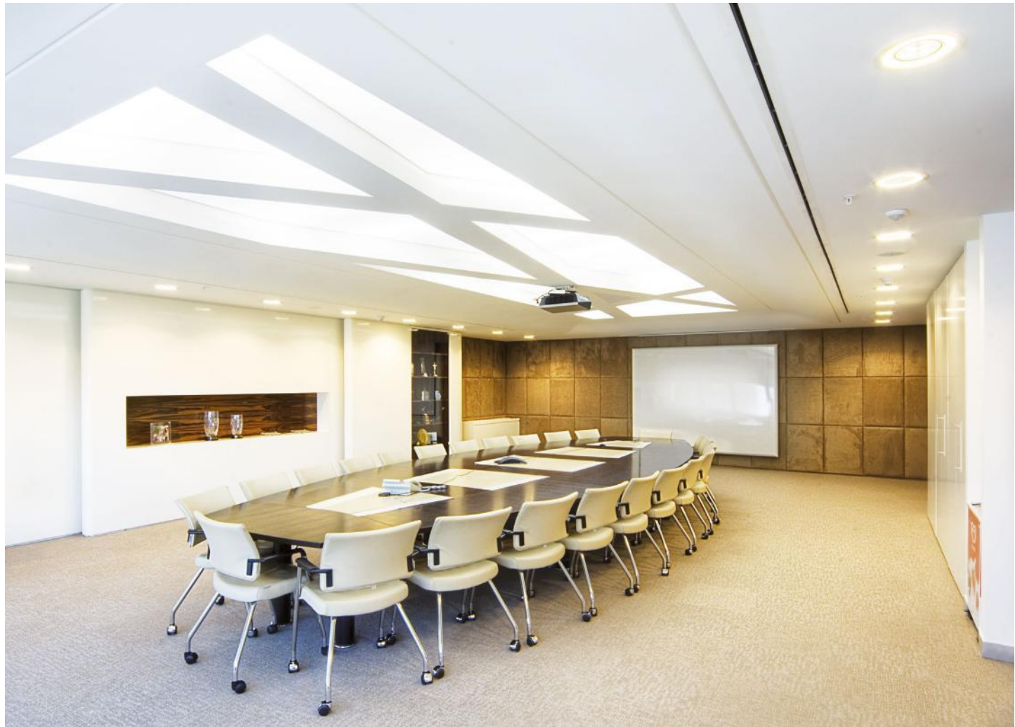
UNILEVER meeting room - Ceiling with backlit structure