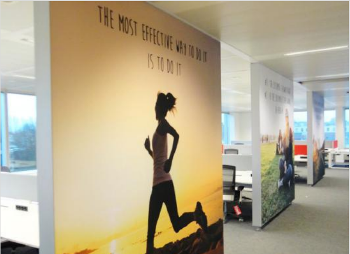
Offices - BELGIUM Acoustic printed partitions, project implementation: MONAVISIA.